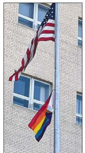
The American flag and the pride flag fly in front of Green Bay City Hall.

"The county ended up just putting forth a referendum on medical marijuana," he said. "We were hoping at the time that they would have done both... I couldn't understand why the county voted that down. I mean, even if you didn't like