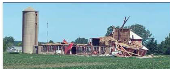
A confirmed EF-1 tornado destroyed structures throughout Seymour.