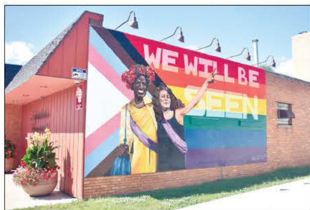
Napalese has provided a safe environment for the LGBTQ+ community for four decades.

Tenpenny said it eventually got to a point where the front door was rendered unusable.