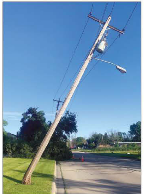
Damaged power line poles on Lenwood Avenue in Howard.