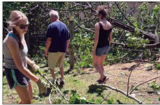
Neighbors banded together to clean up after the storm.