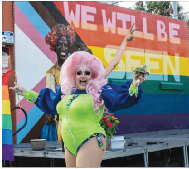
Napalese Lounge and Grille's 40th Anniversary Celebration is set, rain or shine, from 2-9 p.m. Saturday, July 9th.