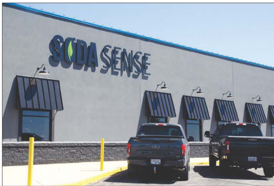
Soda Sense is giving new life to the former Shopko building along Highway 54 in Seymour.

“CO2 is regulated by the Department of Transportation (DOT) as a dangerous good,” Nelson said. “We spent months working with the DOT and the United States Post Office to get