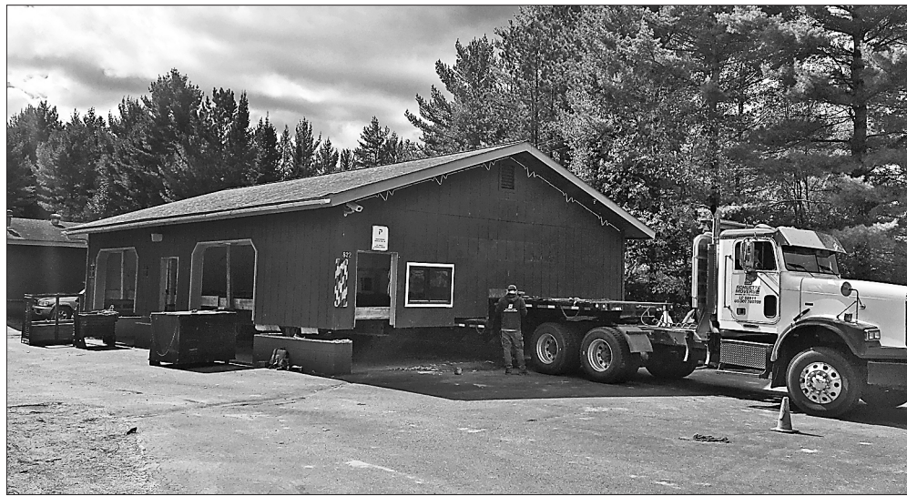
Merrill-based Schuette Movers ready 70 West Auto Body's original two-bay shop facility for its three-mile relocation to 628 Highway 17 South.