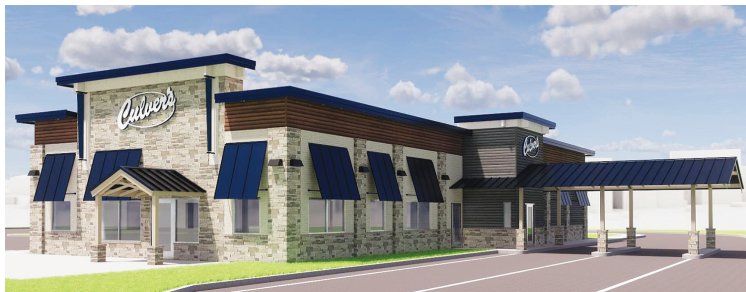
City of Sun Prairie