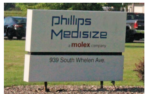
Phillips-Medisize will close its Medford facility.