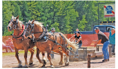
Chelsea Fall Festival Page 8