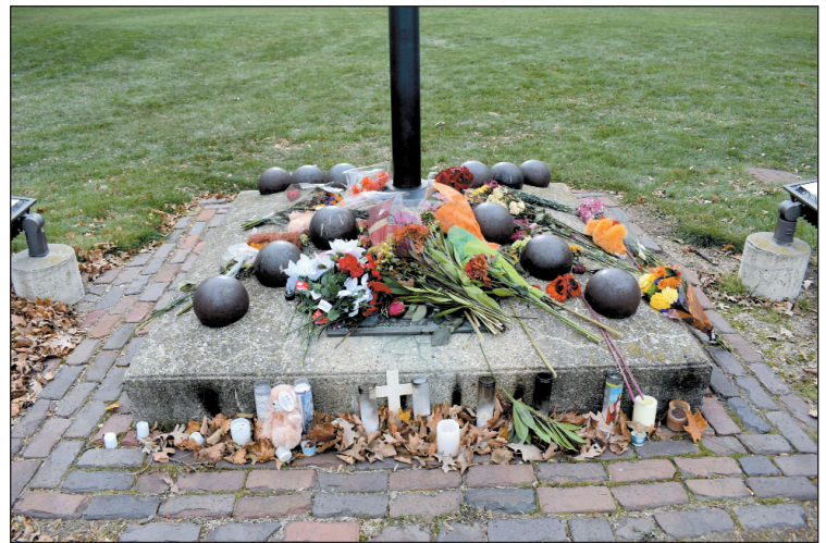
Flowers, candles, crosses and other vigil items are set out in front of the Waukesha Public Library in Cutler Park