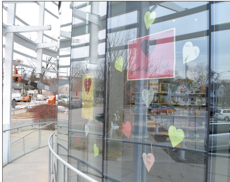
Messages written by community members on heart-shaped paper are posted on the windows of the Waukesha Community Library, 321 Wisconsin Ave., Waukesha.