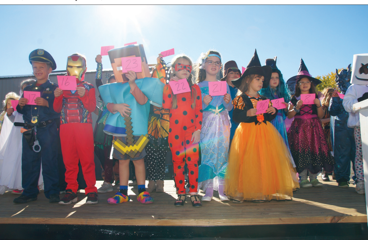
Here is some of the 5 to 7-year-old Costume Contest participants.