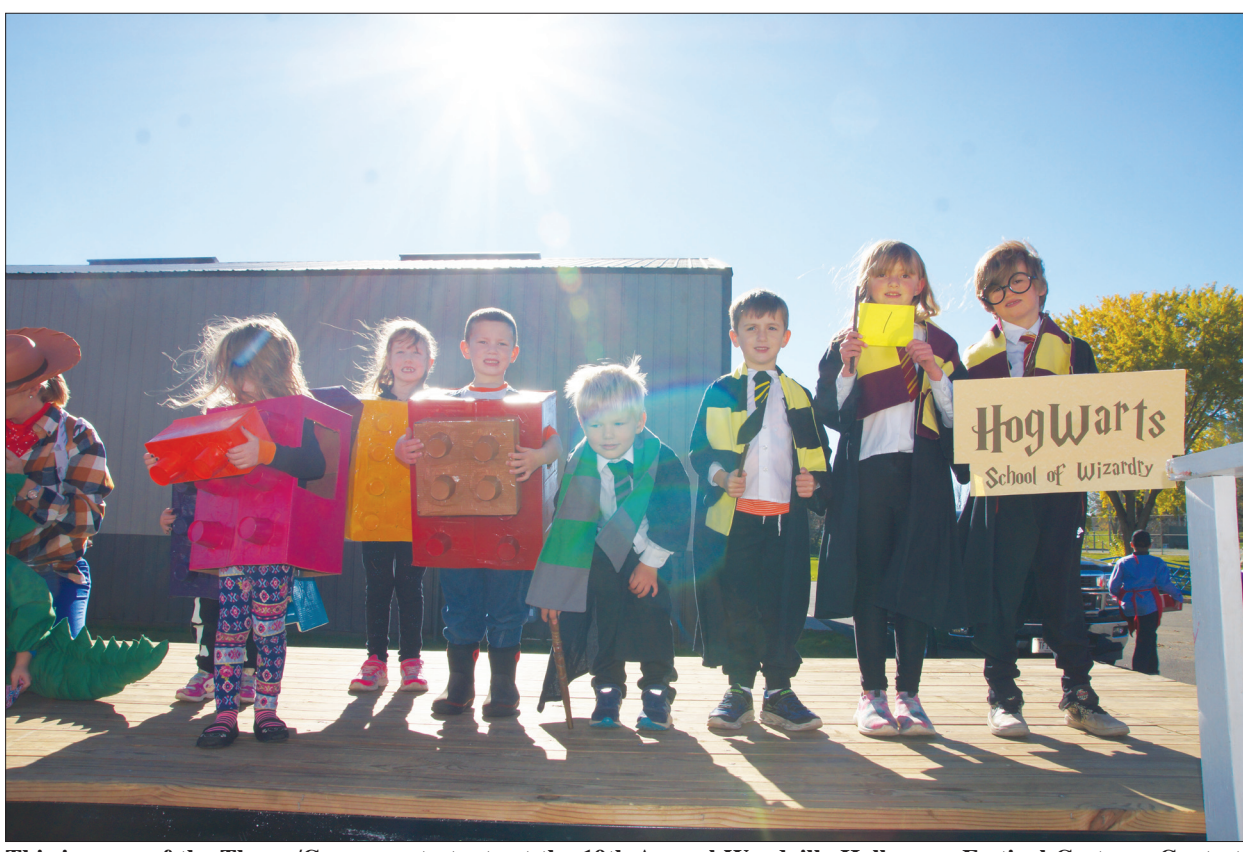
This is some of the Theme/Group contestants at the 19th Annual Woodville Halloween Festival Costume Contest.