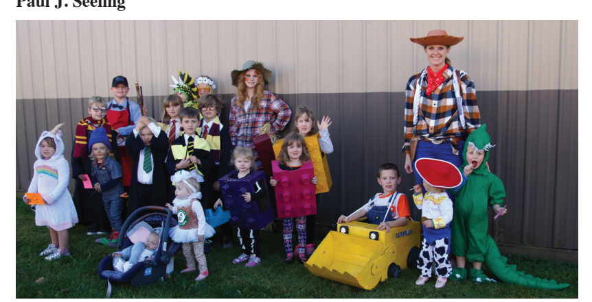
Here are all of the 19th Annual Woodville Halloween Festival Costume Contest winners.