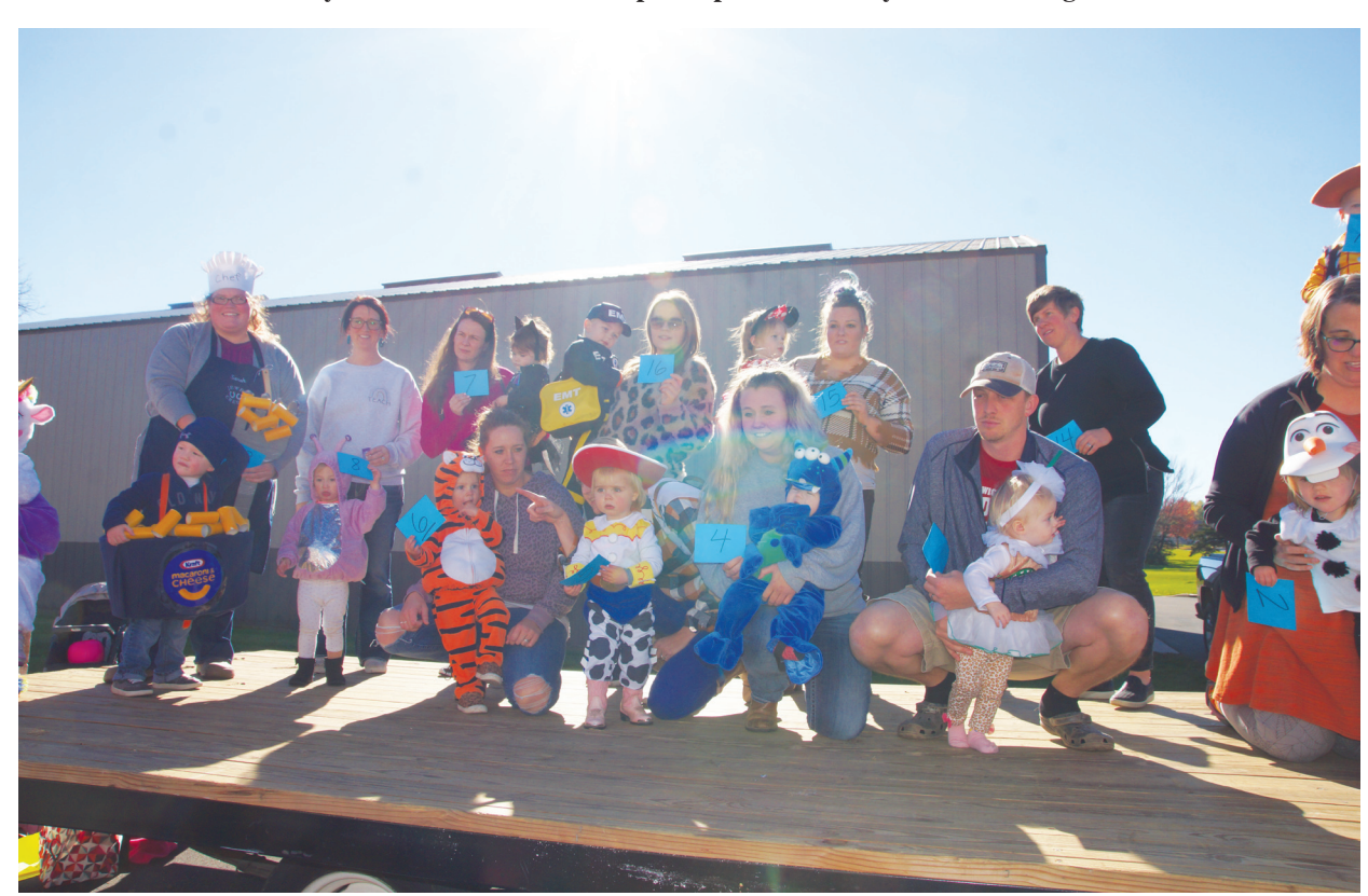
This is part of the 0 to 2 age group in the 19th Annual Woodville Halloween Festival Costume Contest.