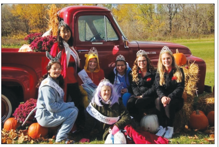
Baldwin, Hammond and Woodville Royalties at the Trunk or Treat event.

On Sunday, the girls were excited to represent Syttende Mai Royalty