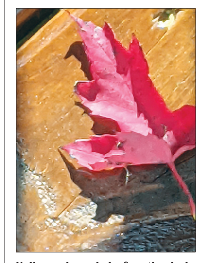
Fallen red maple leaf on the deck.

Submit your photos to editor@ mygateway.news for a chance to have them picked as Photo of the Week!