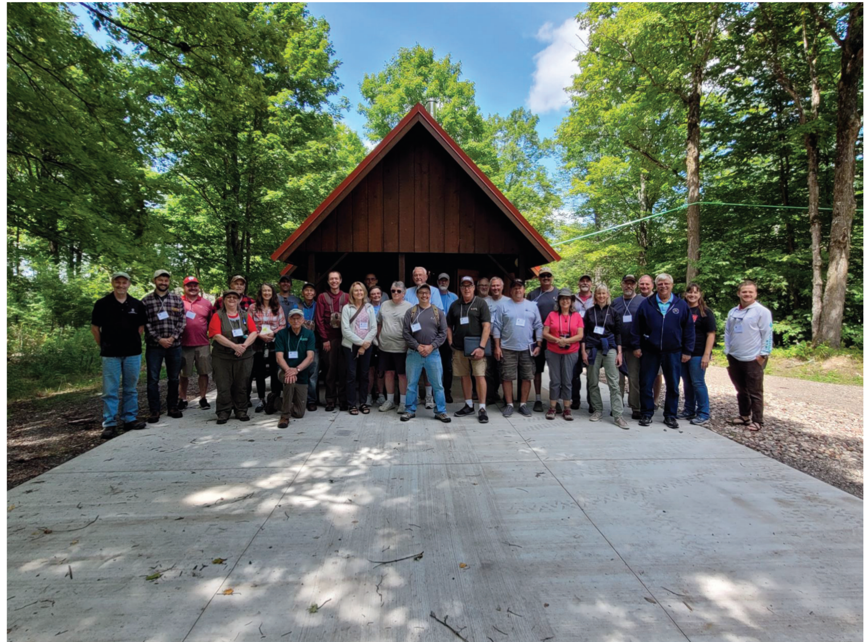
2021 Coverts Project attendees toured the Martin and Sons Maple Syrup sugarbush operation on the Martin property and were able to make and bottle maple syrup to take home. A number of current and retired DNR forestry and wildlife professionals were present to discuss programs such as the Managed Forest Law (MFL) and the Deer Management Assistance Program (DMAP) available to private landowners.

a vehicle that we feel safe and forget about the terrible destruction that can occur from just a moment's inattention, but we must do better."