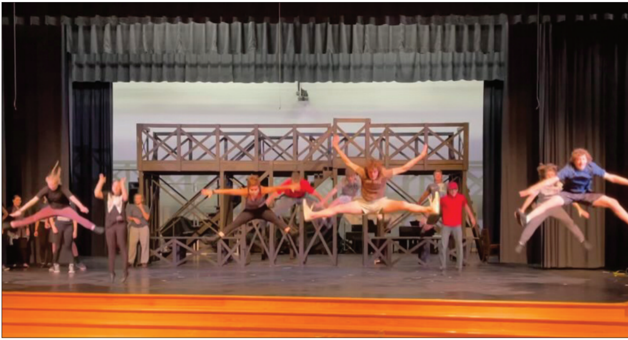
Working in rehearsal on "Newsies" choreography. Get your tickets now for this fantastic musical.