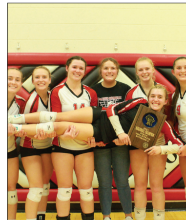
PAGE 8: B-W Girl's Volleyball photos.