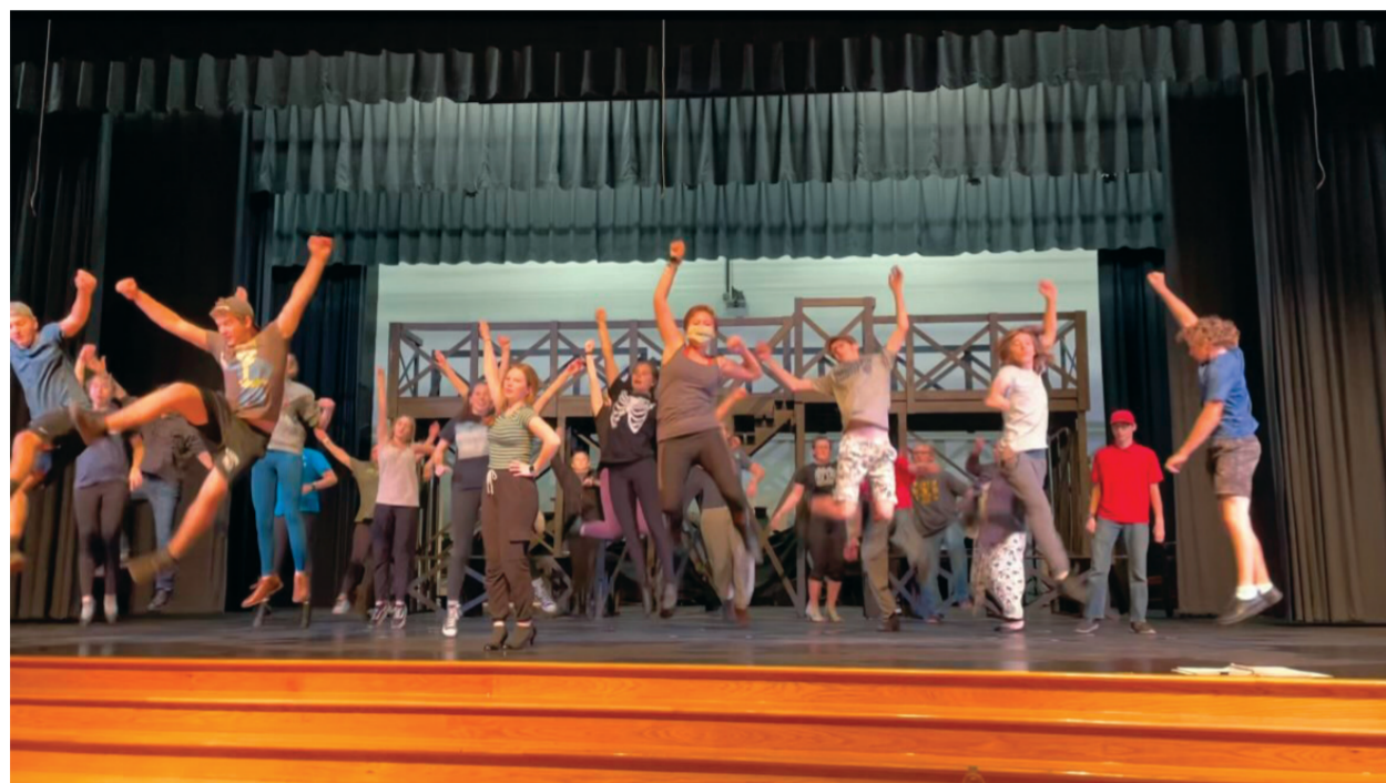
The choreography is stunning for "Newsies" the 2021 musical by the creative talents of the students and staff of the B-WHS Theatre Department.