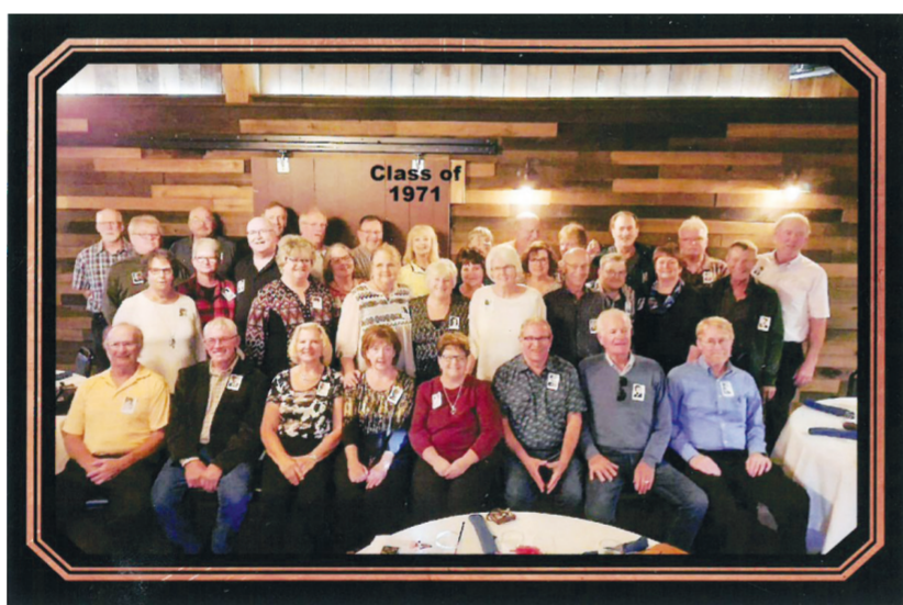
The Baldwin-Woodville Class of 1971 at their 50th Class Reunion on Saturday, September 25, 2021, at the Phoenix in Baldwin. Submitted photo

A group photo of those commemorating their Baldwin-Woodville