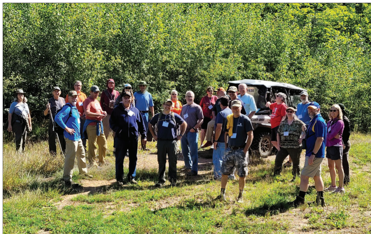
Here is a group photo of the attendees of the 2021 Wisconsin Coverts Project workshop held August 12-15 at Kemp Natural Resources Station in Woodruff, WI.