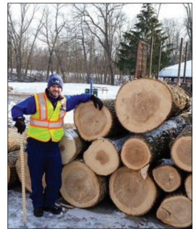
PAGE 5: Celebrate Wisconsin's working forests.