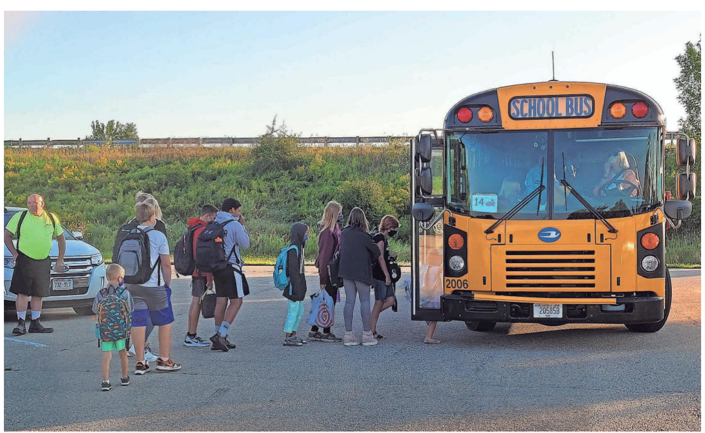
Children line up for the school bus to go to Winneconne Area Schools at a park-and-ride by the Wiouwash Trail. The bus stop was eventually moved because it was located in the Oshkosh Area School District boundaries, and Winneconne used it without permission. Parents say the new bus stop location is unsafe.