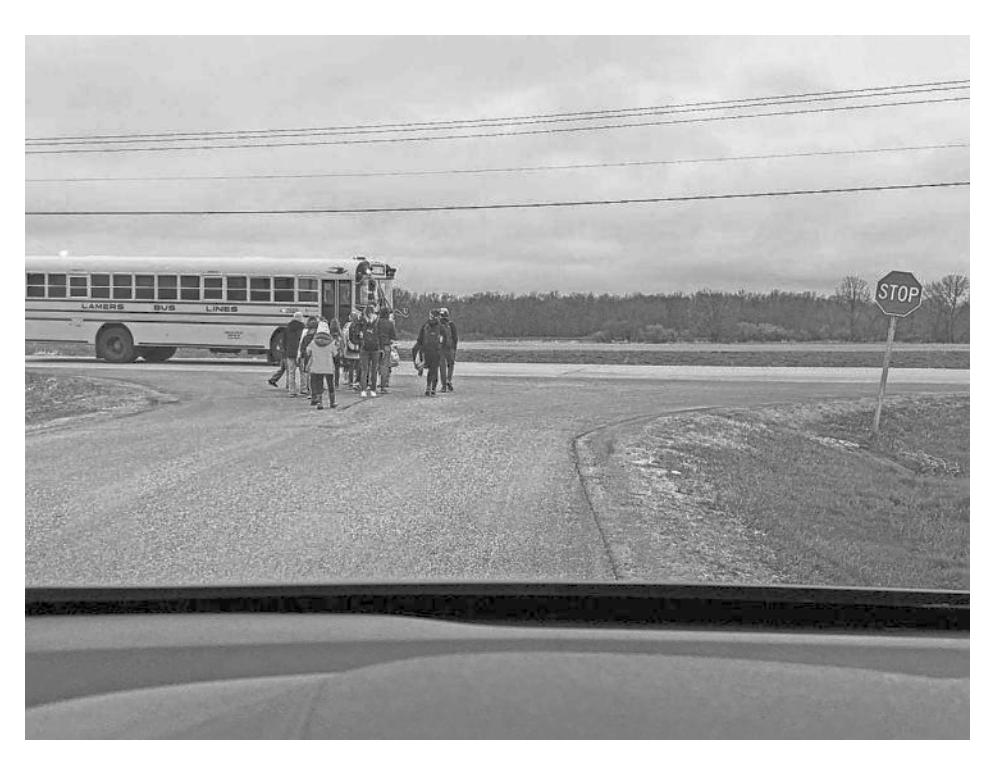
Children lining up at the bus stop for pick up on County Road S and Gray Wolf Drive. Parents have said the new location is not as safe as the old stop at a park-and-ride.

According to parents, to limit the possibility of kids who are running late to catch the bus, the bus was only allowed to start pickup in the morning at a specific time.