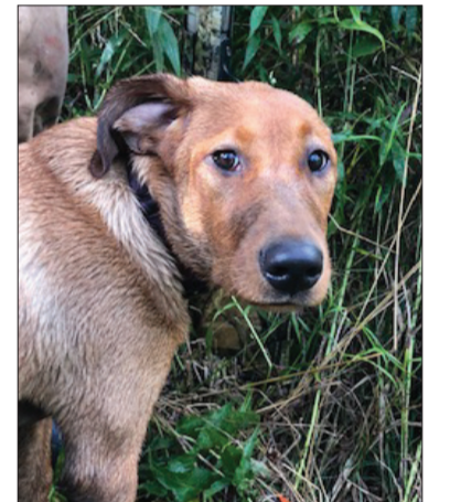
When you'd rather play in the mud than sit in the blind.

Submit your photos to editor@mygateway.news for a chance to have them picked as Photo of the Week!