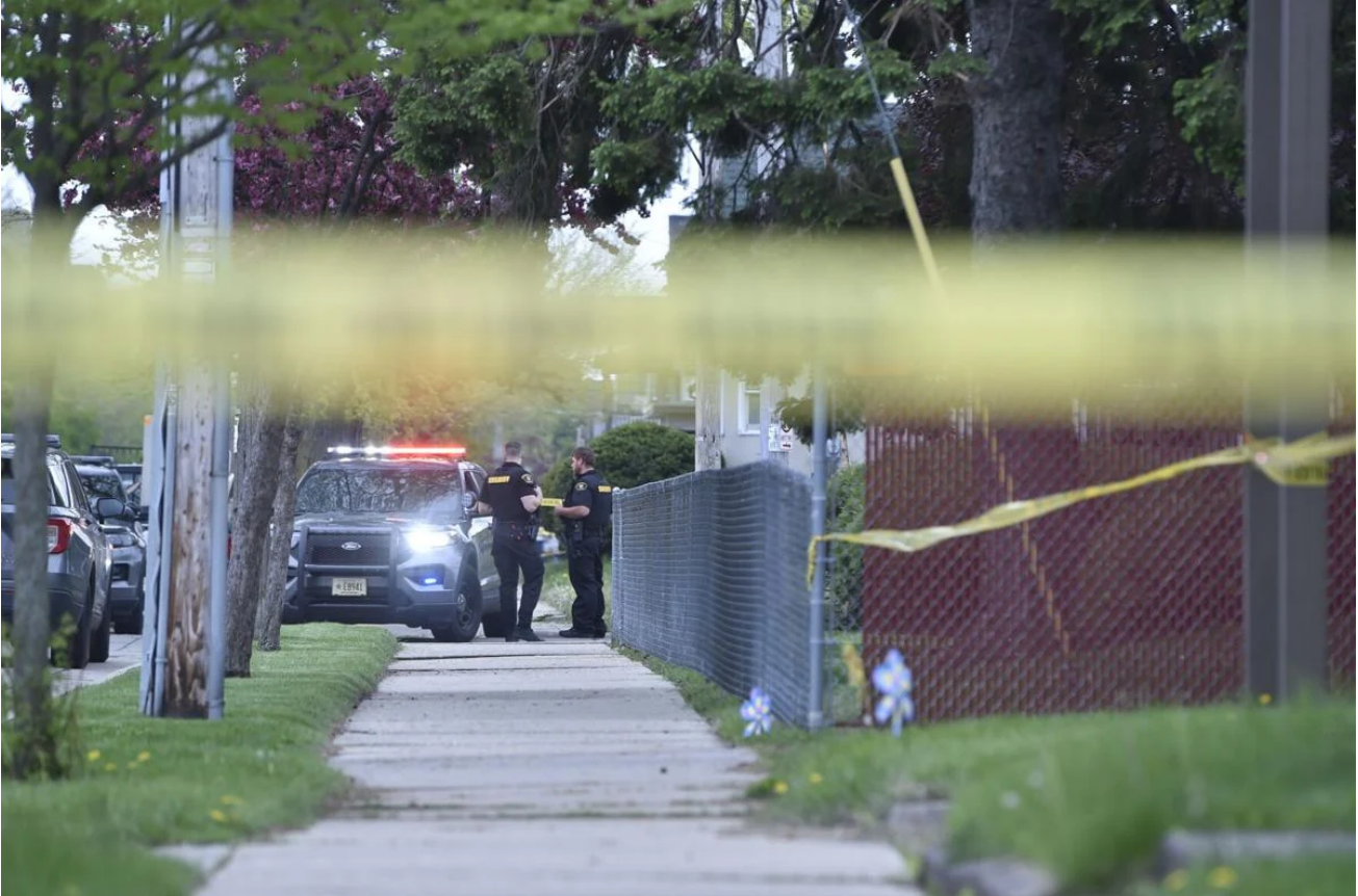
Deputies stand behind police tape on Center Street Friday in Racine. RYAN PATTERSON,