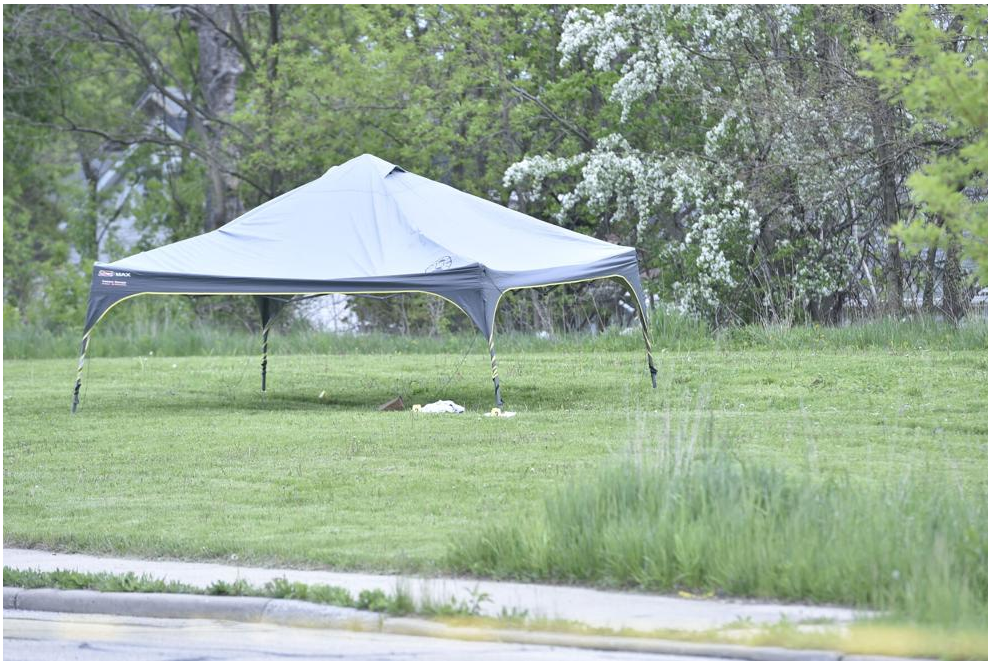
A canopy stands on a grassy area near Carroll Street Friday in Racine about two hours after officers were seen giving CPR to an individual there.