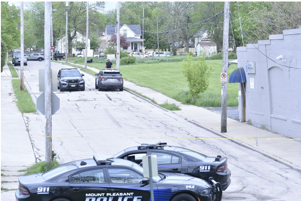
Law enforcement vehicles park on Carroll Street Friday in Racine. Part of a tent is seen on the grass at right.