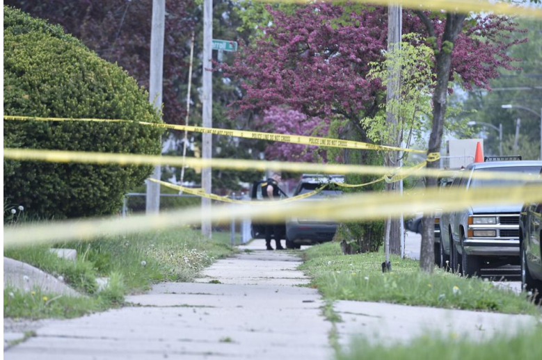
An officer stands behind police tape Friday in Racine's Midtown neighborhood.

An initial report from DCI stated: "Following a foot chase, the subject was seen with a handgun."