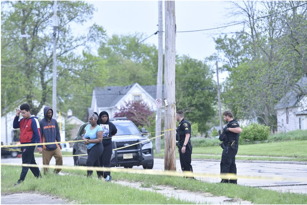
Sheriff's Office deputies talk with residents on Carroll Street Friday in Racine.