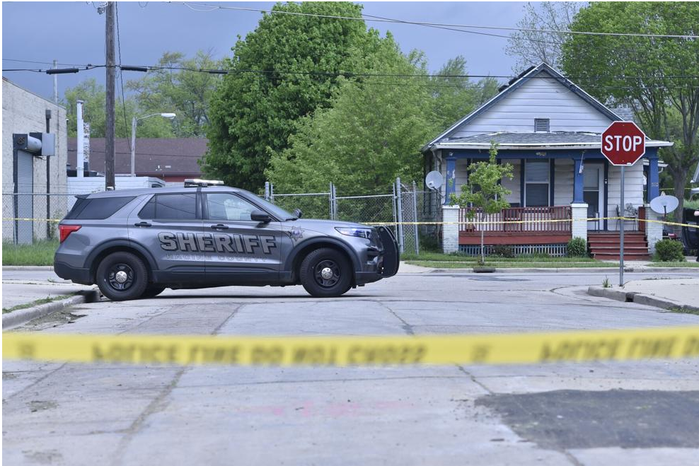
A Racine County Sheriff's Office squad vehicle and police tape are shown blocking access to 12th Street Friday in Racine. RYAN PATTERSON,