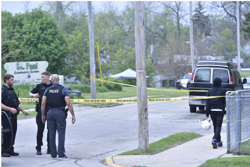
Police officers converse at the intersection of Carroll Street and Center Street Friday in Racine.