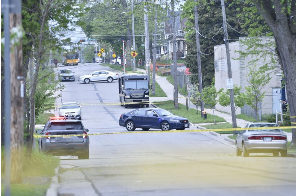
Police tape covers multiple intersections looking west on 12th Street Friday in Racine.