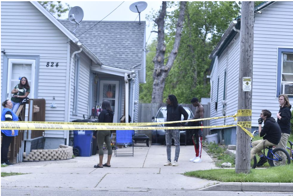
Several residents talk behind police tape on 12th Street Friday in Racine Friday in the Midtown neighborhood.