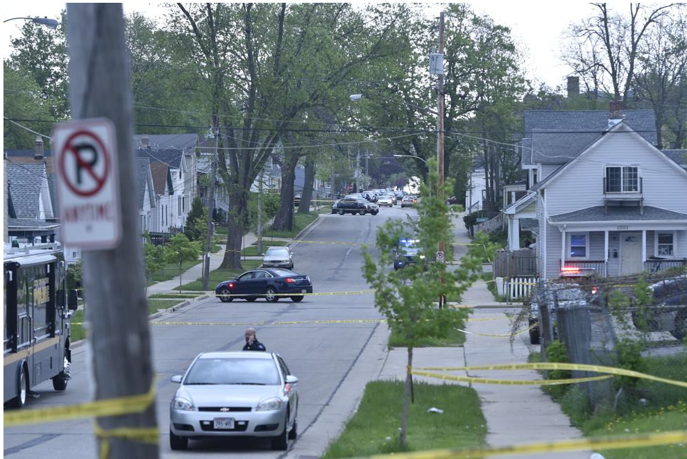
Police tape covers multiple intersections looking east from 12th Street Friday in Racine.