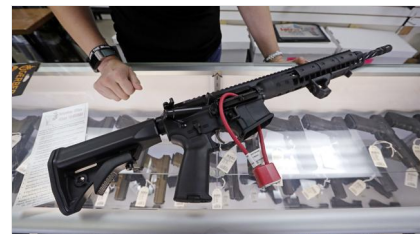
How to get a free gun lock in Racine