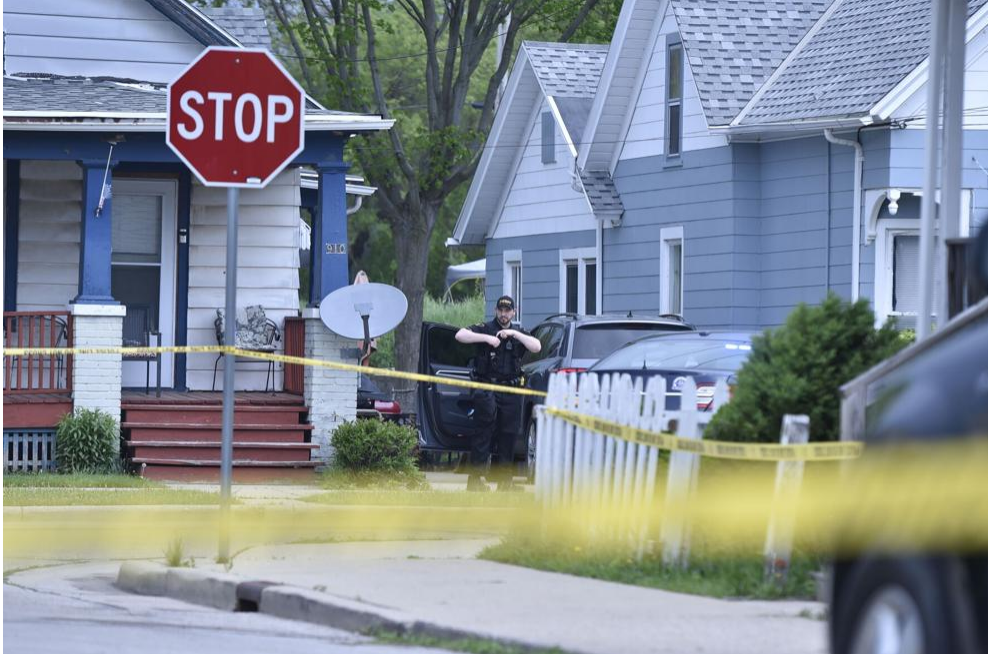
An officer exits his vehicle on 12th Street Friday in Racine.