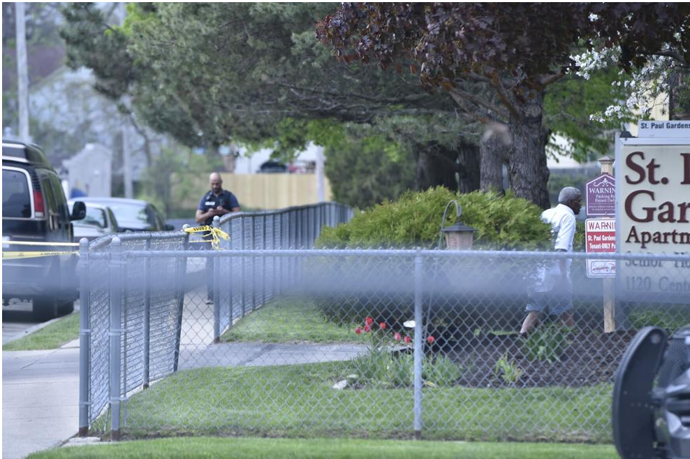
A police officer and resident walk near St. Paul Garden Apartments, 1120 Center St., Friday in Racine.