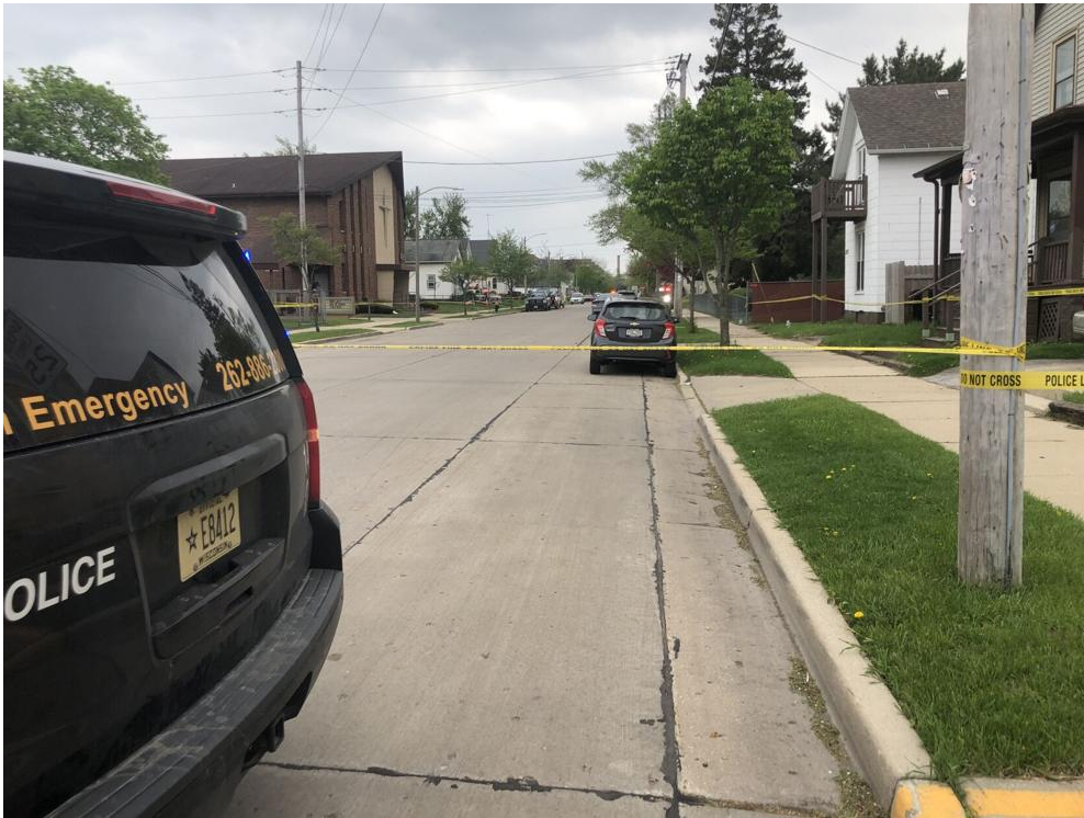
Police tape is shown here at the intersection of 11th and Center street Friday afternoon. Ryan Patterson