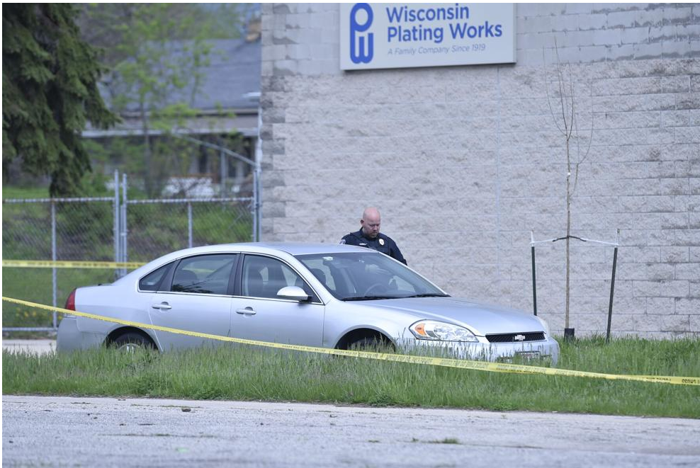
A Racine Police Department officer stands in front of Wisconsin Plating Works, 931 Carroll St., Friday in Racine.