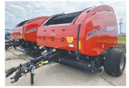
2020 CASE IH RB565 5' x 6' Premium 2, 21.5L-16.1 Tires, Endless Belts, Net or Twine, 1000 PTO $45,500

2350 hours, 18" Tracks, 88" Spacing, 3Pt, 1000 PTO, Luxury, Guidance Complete