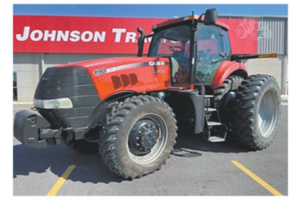
2013 CASE IH MAGNUM 190 3330 hours, 18.4-46 Rear Duals, Frt Singles, 3Pt, 540/1000 PTO, 4 Valves, Luxury Guidance Rdv $114,500 + 0% for 12 months!