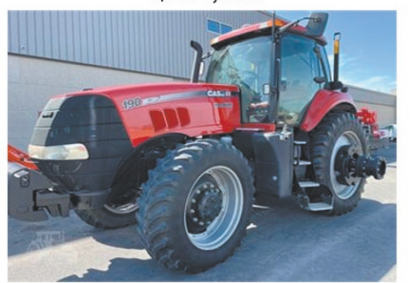
2013 CASE IH MAGNUM 190 3225 hours, 18.4-46 Rear Duals, Frt Singles, 3Pt, 540/1000 PTO, Guidance Complete, 4 Valves, Luxury $117,500 + 0% for 12 months!