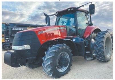
2015 CASE IH MAGNUM 200 2200 hours, 18.4-46 Duals, 19 Speed PS Susp. Front Axle, 3Pt, 540/1000 PTO, 4 Valves Luxury Cab, Guidance Rdy $137,500 + 0% for 12 months

2017 CASE IH MAGNUM 340 ROWTRAC CVT 1705 hours, 18" Tracks, Continuous Variable Transmission, 3Pt, 1000 PTO $259,500