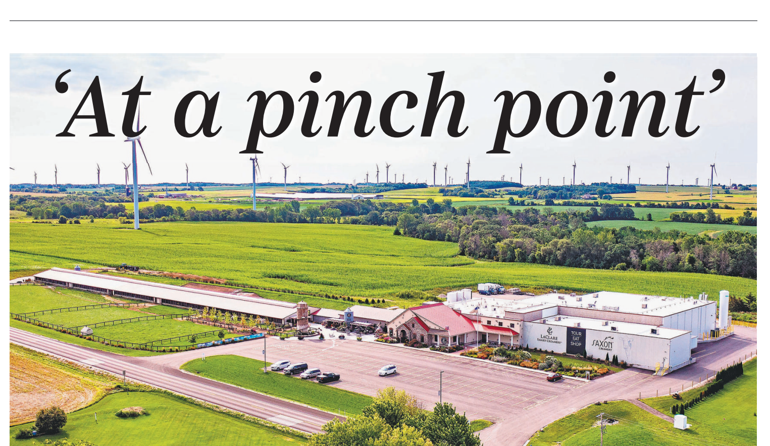
Nowhere in the U.S. has the growth of the dairy goat industry been more evident than in northeast Fond du Lac county and southern Calumet county, an area known as the "Dairy goat capital of the U.S." Securing that reputation is Chilton Dairy and Drumlin Dairy located just 7 miles apart in the town of Brotherton. Both dairies supply LaClare Family Creamery, a national leader in the goat cheese industry.