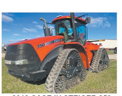
2013 CASE IH STEIGER 350 ROWTRAC