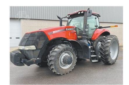
2017 CASE IH MAGNUM 250