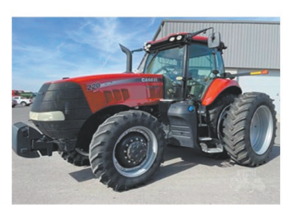
2016 CASE IH MAGNUM 220 CVT

2017 CASE IH MAGNUM 340 ROWTRAC CVT 1705 hours, 18" Tracks, Continuous Variable Transmission, 3Pt, 1000 PTO $259,500