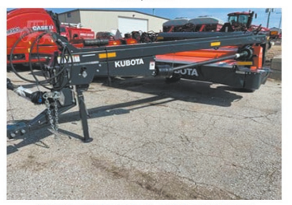
2020 KUBOTA DMC8032R 10', Rubber Rolls $23,500