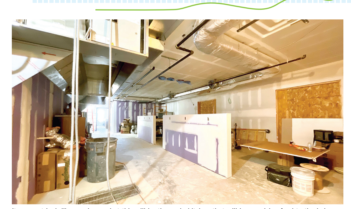
It may not look like much now, but this will be the main kitchen that will be supplying food to the in-house

residents as well as the senior meal sites throughout the county.