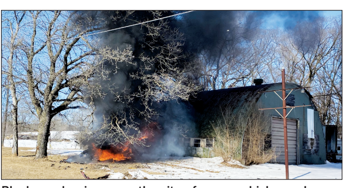
Black smoke rises over the site of a one-vehicle crash. One person was killed in the accident.