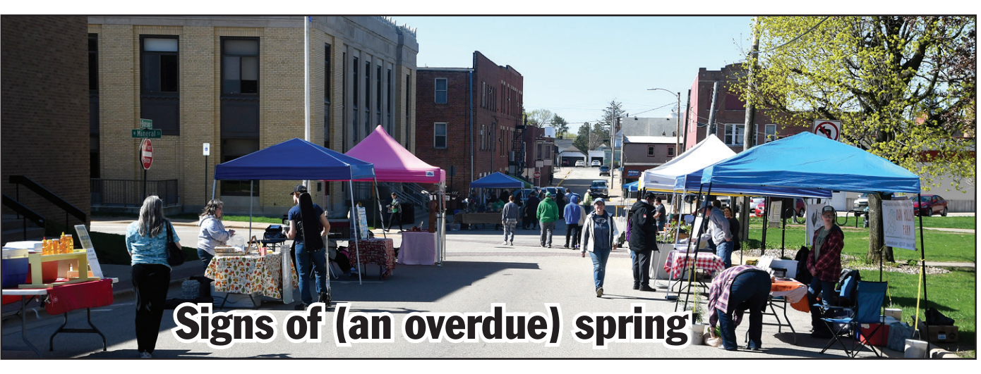
After poor April weather, spring suddenly arrived with the start of the Platteville Farmer's Market on Bonson Street Saturday morning, including music. The farmer's market is Saturdays from 8 a.m. until noon through October.