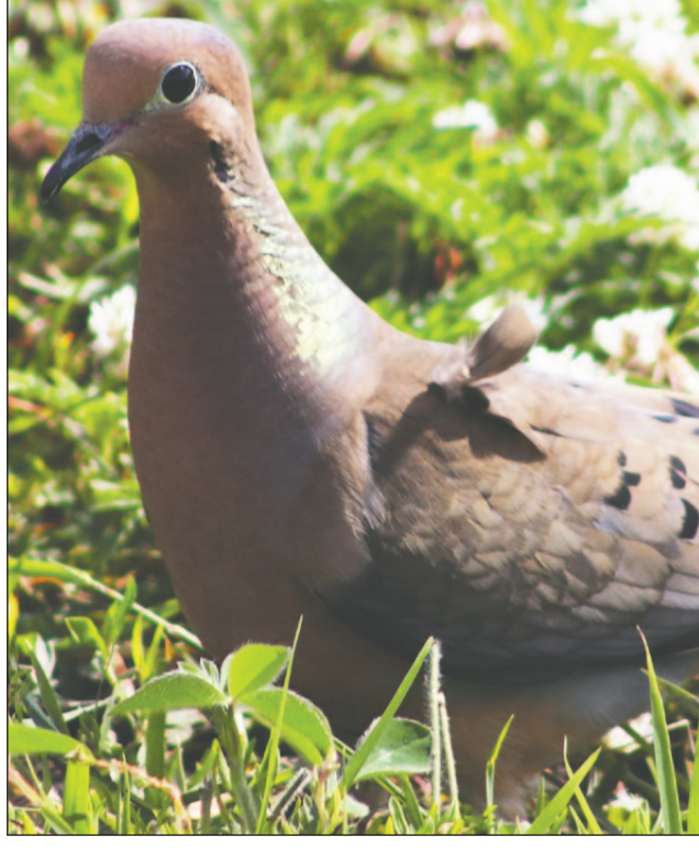
Cooing gently, a delicate mourning dove makes her way across a Shell Lake lawn, the early-morning sunlight illuminating the many brilliantly-colored feathers of her plumage. The soft calls of the birds are a morning treat.