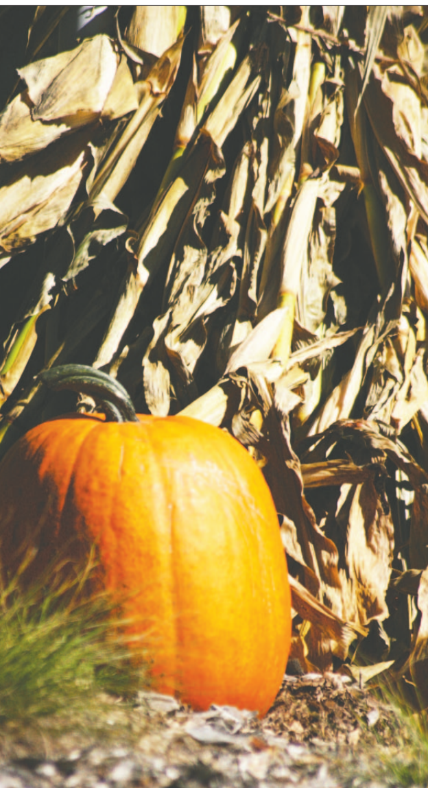
Few sights make one think of October days like dried stalks of corn and bright, orange pumpkins below them.