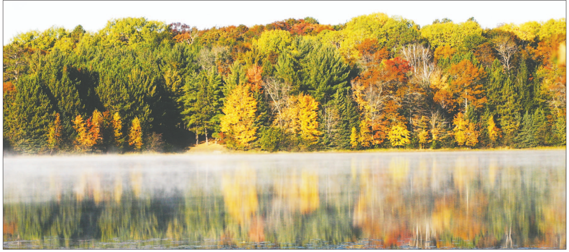
October morning brings vivid colors bursting from the treetops, while a white fog rolls gently across the motionless, mirrorlike surface of quiet Northwestern Wisconsin lakes and ponds.

From spectacular leaves to white fog at dawn, October is a beautiful show