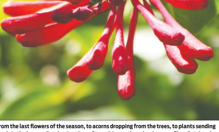
From the last flowers of the season, to acorns dropping from the trees, to plants sending seeds in the breeze, October is a time of transition as the calendar page flips. October days can be warm as red flower pedals, or cold as the first white, frosty morning of the season.