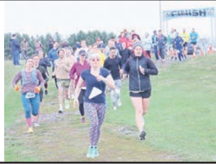
Competitors brave weather for RC2 Run/Walk, p. 13