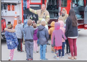
Green Lake students meet first responders, p. 12