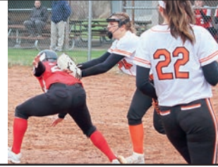
Ripon executes rundown to top Lomira, p. 14