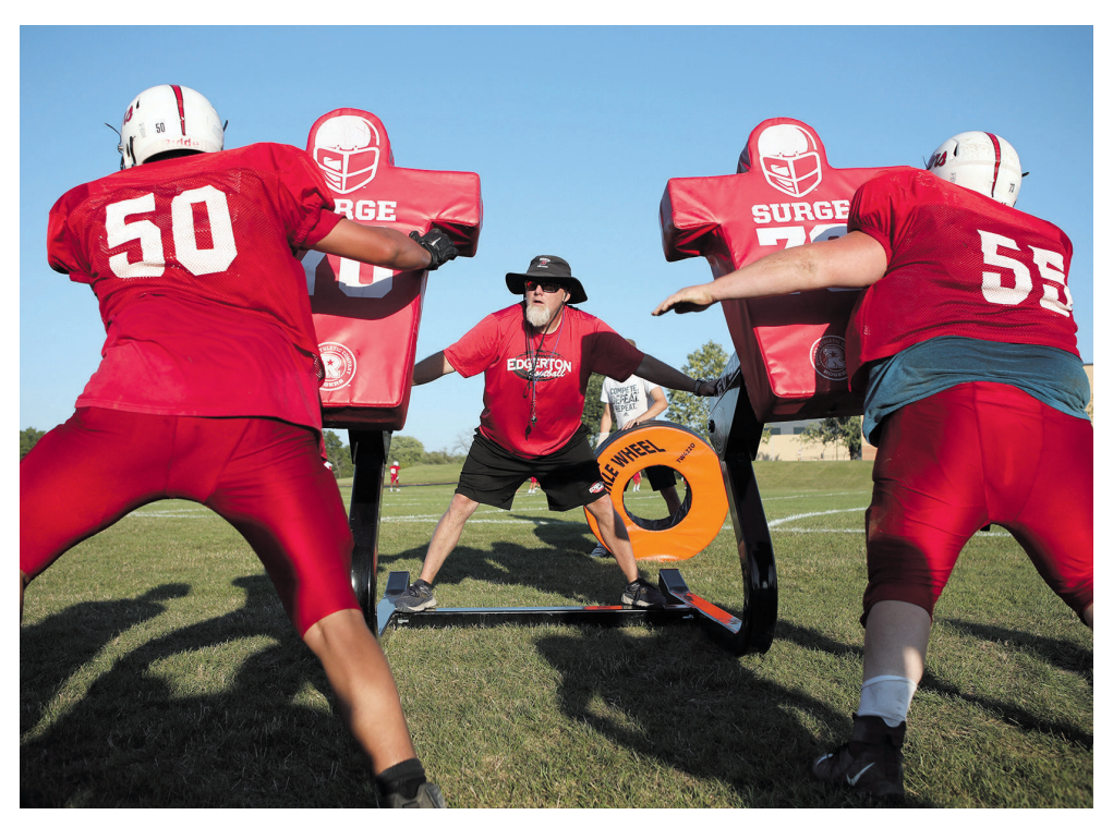
The Crimson Tide are training hard for the upcoming football season. Full coverage in The Reporter's fall sports preview, out later this month.

Students are eager to come back into schools as the COVID pandemic appears to be changing the rules and allowing better outlooks for all.