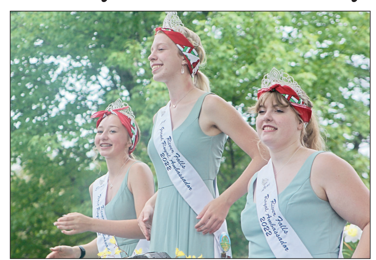
The River Falls Royal Ambassador crew made their way over to their neighbors stomping ground for the Pepper Fest parade.

Although the late morning parade started off a bit gloomy, the sun began to peek through toward