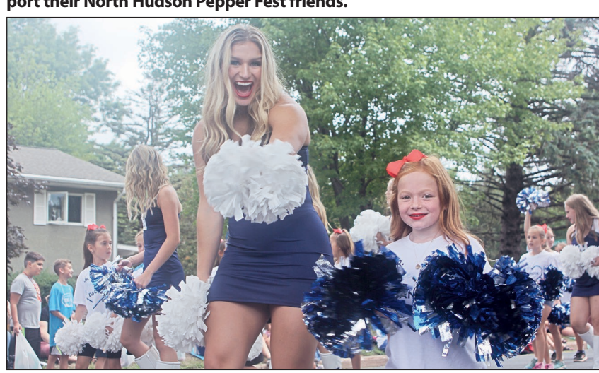
Everyone was cheering for Pepper Fest.