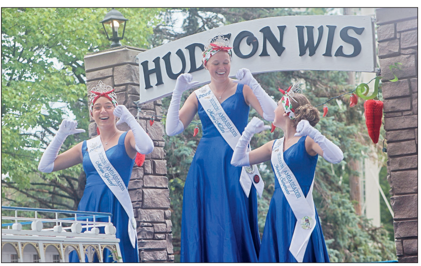
The Hudson Ambassadors made the long trek across Lake Mallalieu to support their North Hudson Pepper Fest friends.