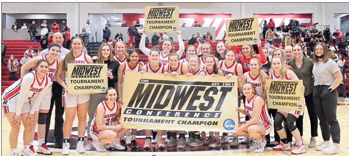
MEMBERS OF THE Ripon College women’s basketball team celebrate after winning the Midwest Conference Tournament last week Saturday.