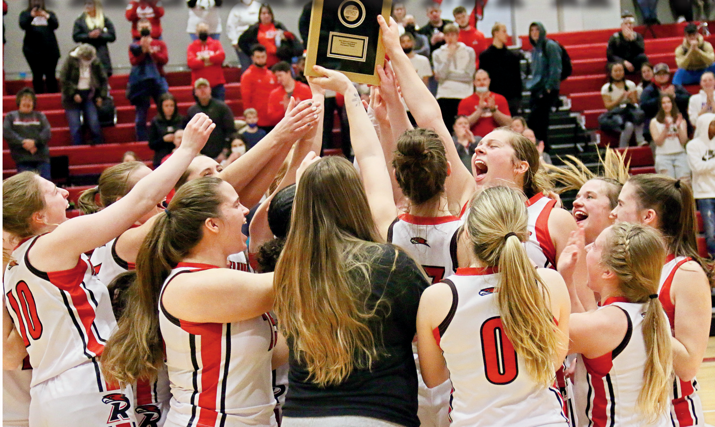
THE RIPON COLLEGE women's basketball team celebrates with the Midwest Conference Tournament plaque after defeating Monmouth 62-55 in the championship game last week Saturday.