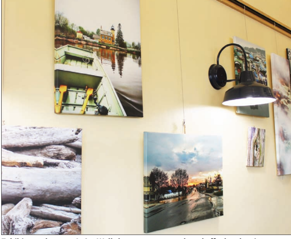
Exhibits at the co-op's Art Wall change every month and offer local artists a chance to gain a wider audience.