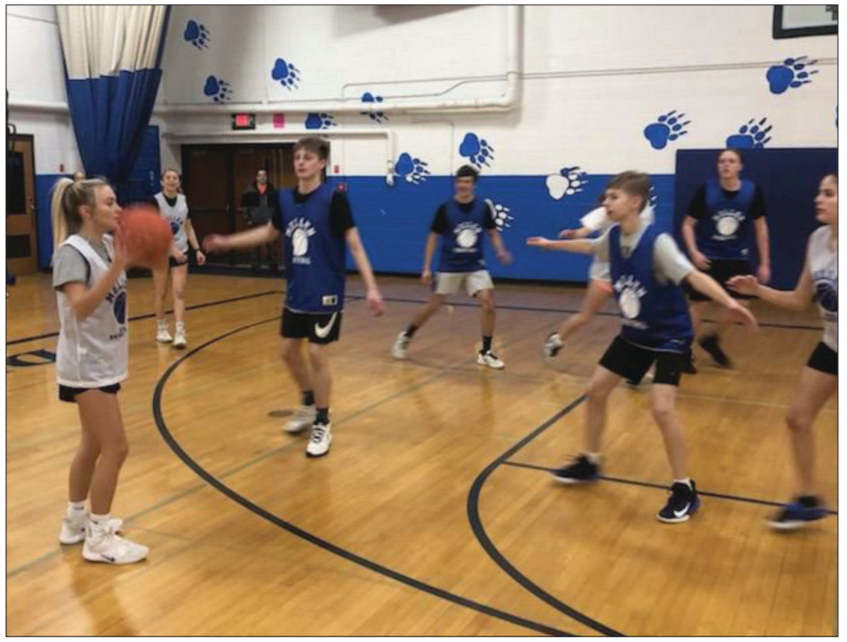
Like many teams in the area, the Mellen Granite Diggers boys and girls basketball teams have had to cancel games this season and have run combined practices as players have come down with COVID.

With games to make up, Mellen may be squeezing in play, making practice time even more coveted. Regard-