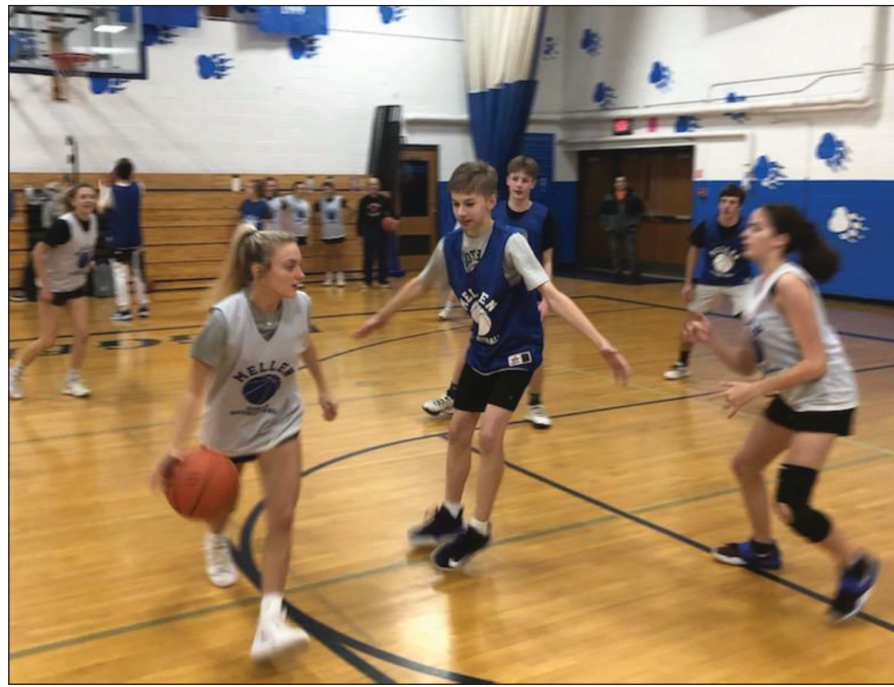
With players out due to COVID, practice time is even more valuable, coaches said.

less, Moreland said the team's expectations will remain the same. "Goals are similar