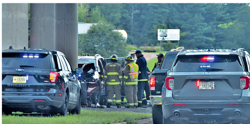
KENTON TROUTMAN | THE CHETEK ALERT