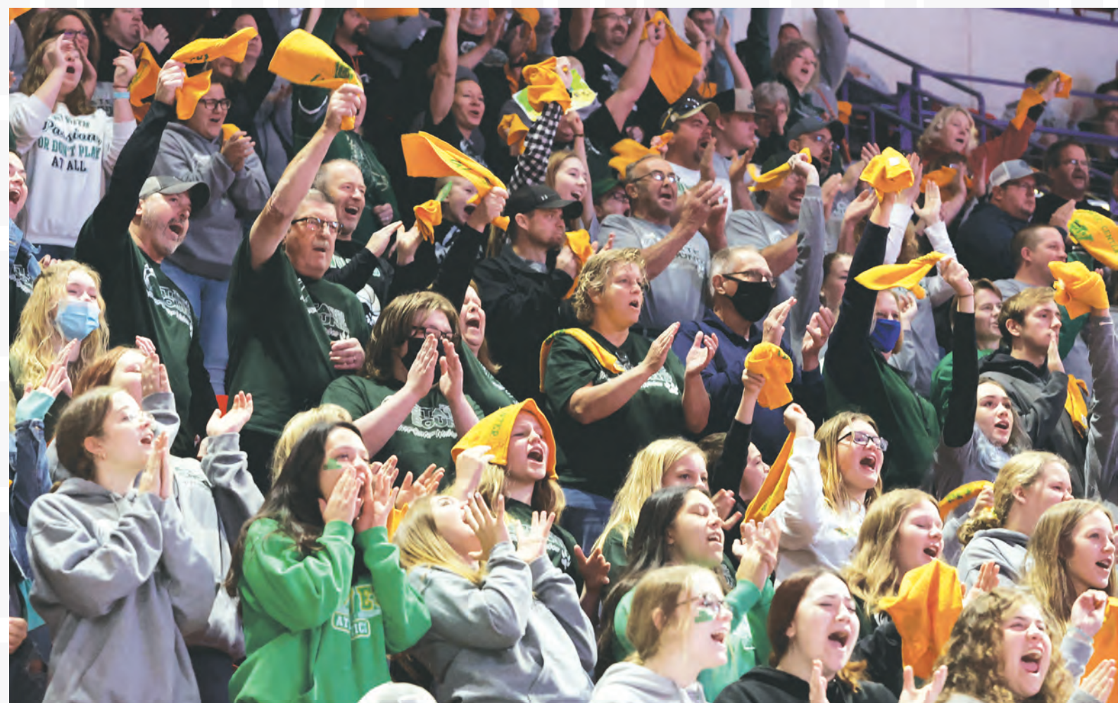
Wonewoc-Center's fan section showed up in a big way at the volleyball team's state debut at the Resch Center.