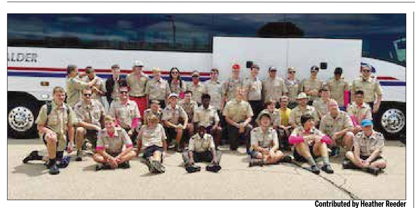
Sun Prairie Boy Scout Troop 333.