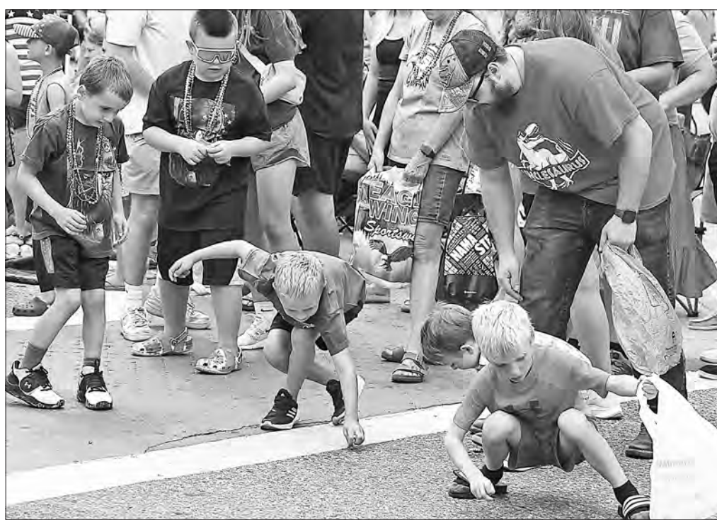
Scrabbling for candy at the Eagle River July 4 parade.

KALMAR BINGO — Mondays, including holidays. Doors open at 4:30 p.m., Early Birds at 6 p.m., regular at 7 p.m., at the Kalmal Community Center in Eagle River. Call (715) 337-2510.