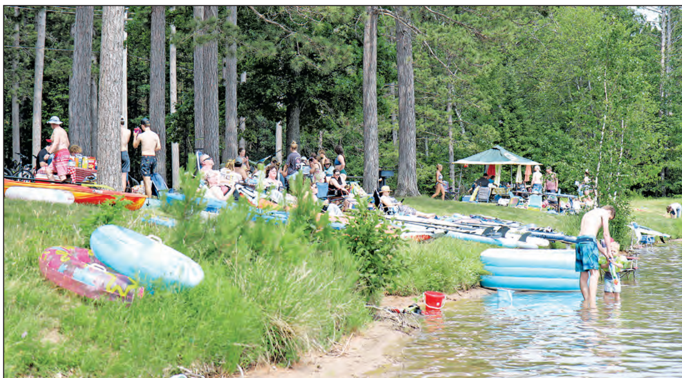
BUSY BEACHES — Lakeside is a popular place to be throughout the summer in the North Woods. Crowds packed the beach at