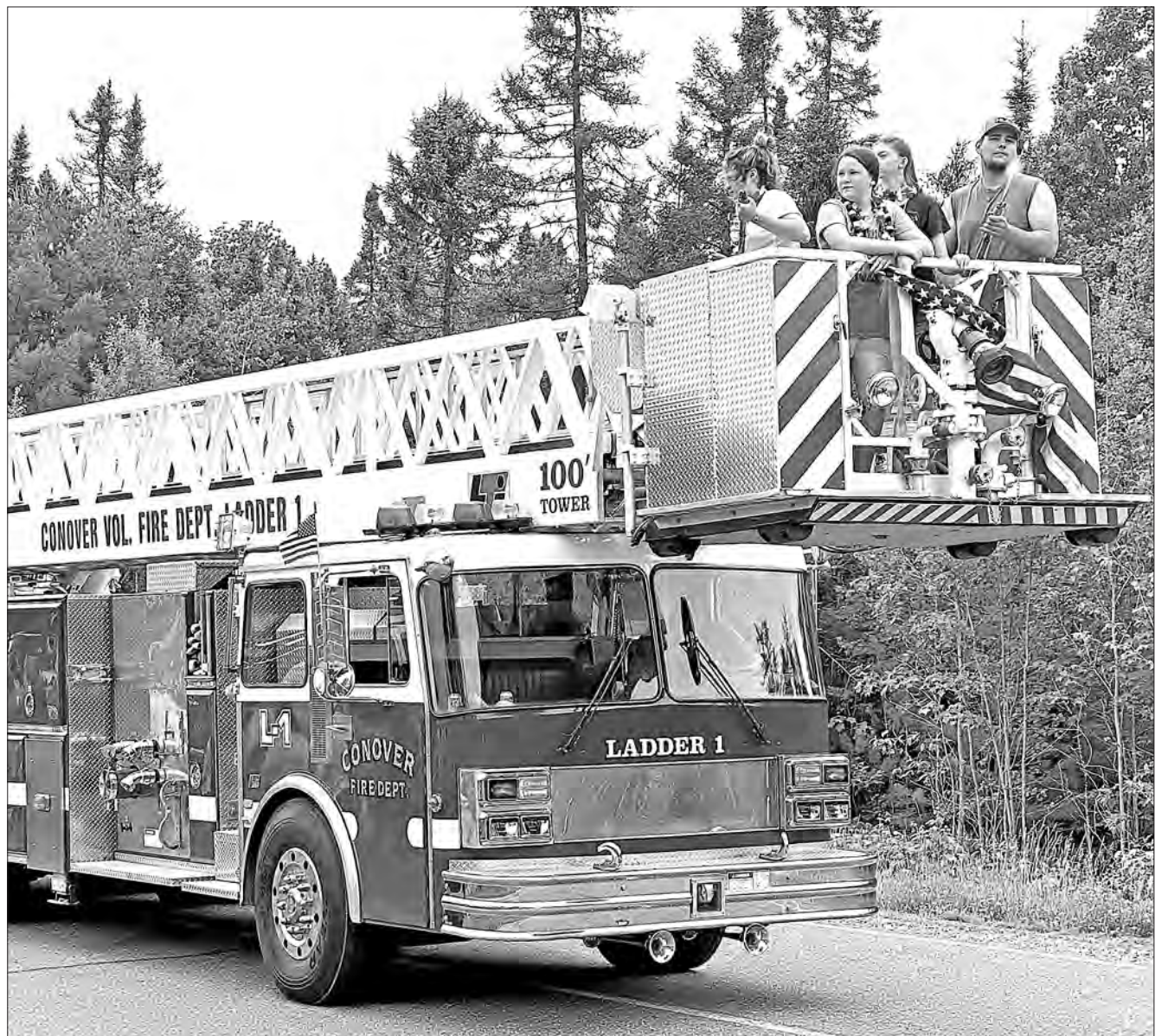
INDEPENDENCE DAY — Conover celebrated this Fourth of July with a parade, picnic in the park and waterski show. Area businesses, organizations and clubs all participated in this year's parade.

For more information, visit boulderjct.org or call the chamber at (715) 385-2400.