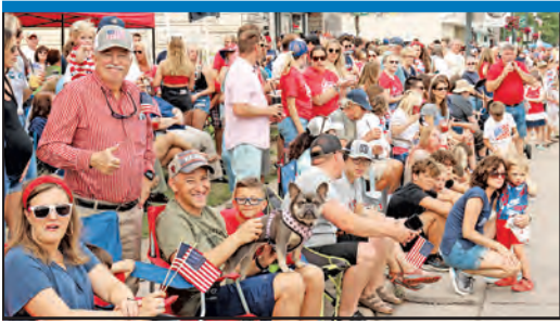
EAGLE RIVER, WI 54521