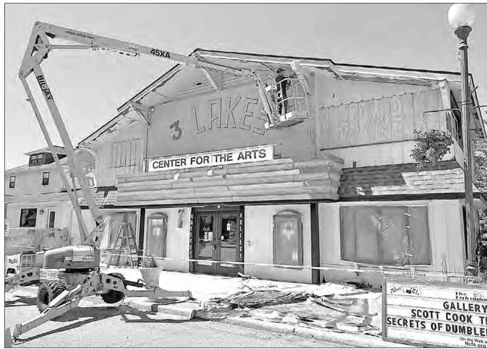
The Three Lakes Center For The Arts, located on Superior Street in downtown Three Lakes, got a sprucing up with a fresh paint job recently. The center hosts live musical performances, movie screenings and houses a small art gallery as well.

Due to the pressure of TV, the theater went "dark" in