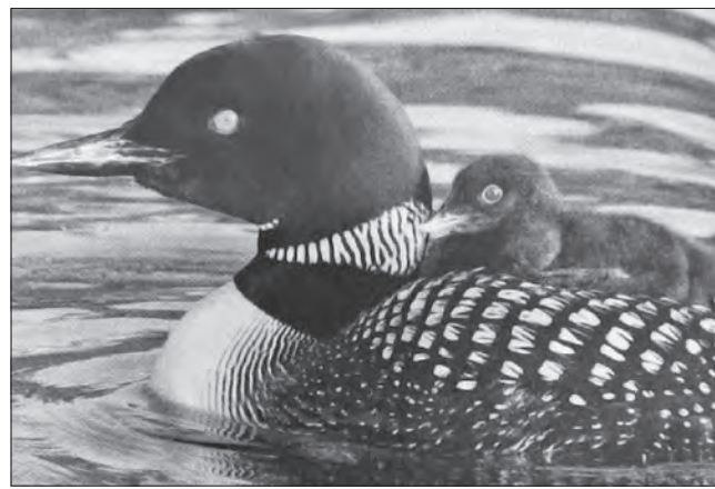
In 2012, a late nest produced a loon chick that was just days old after the Fourth of July. They were seen on Planting Ground Lake in Three Lakes. —News-Review Archive

For more information or reservations, call Vice President Claire Boles at (414) 659-8471.