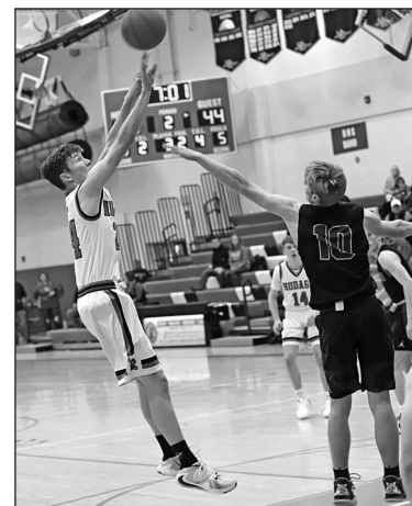
BOB MAINHARDT FOR THE RIVER NEWS

Rhinelander (8-9, 4-3 Great Northern) dropped its fourth straight game to fall below .500