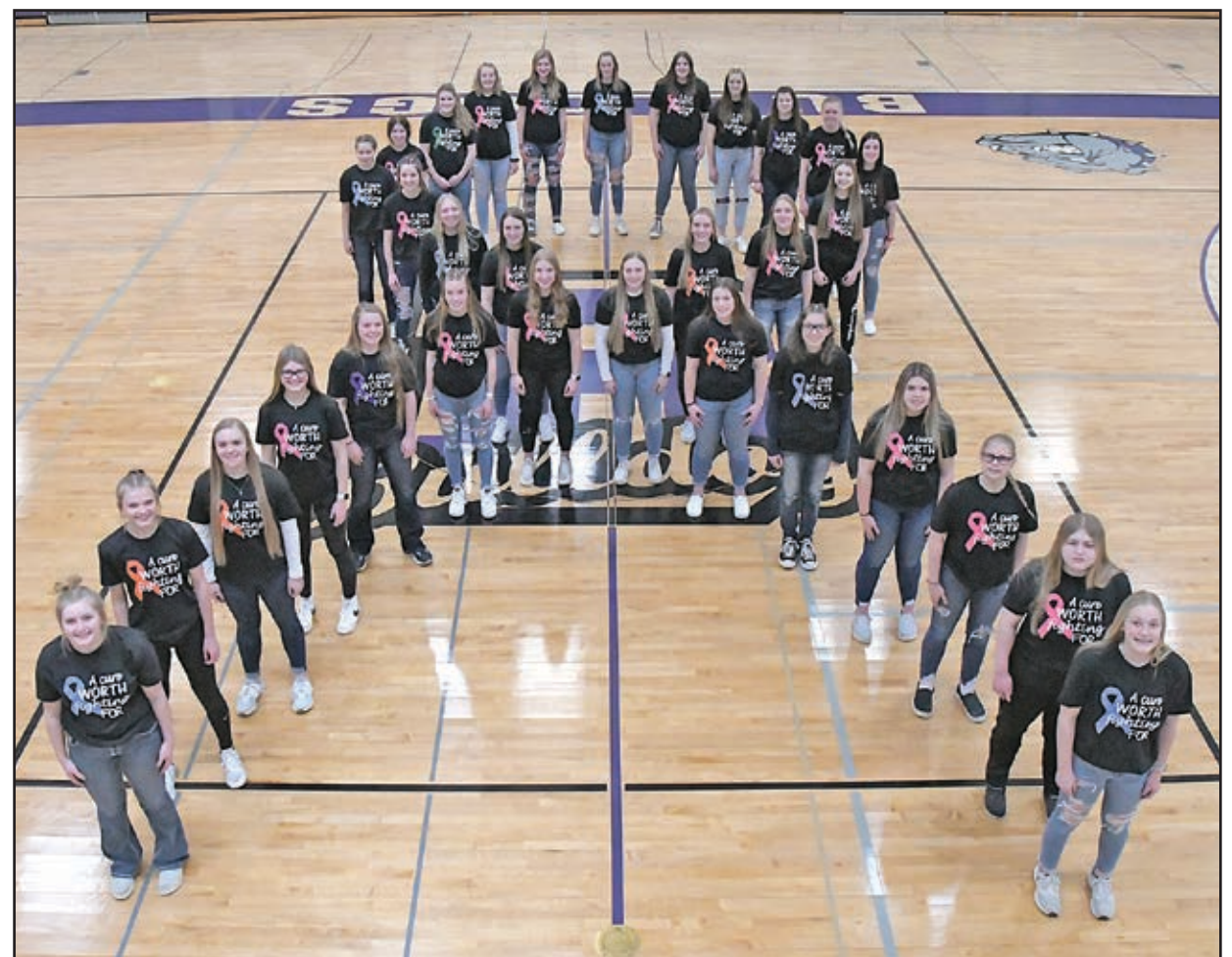
TEAMING UP TO FIGHT CANCER — Players on the Boyceville and Glenwood City girls' basketball teams stood in solidarity Thursday, February 17 in the fight to end cancer. Together, players on both squads formed a ribbon in Boyceville's High School gym to kick off the 11th annual "Coaches versus Cancer" fundraiser before donning their respective school colors to do battle on the hardwood. The event featured a silent auction, raffles, dash for cash and food with all proceeds going to the American Cancer Society to aid in its search for cures. A record $14,564.41 was raised at this year's event, bringing the 11-year total to nearly $75,000.