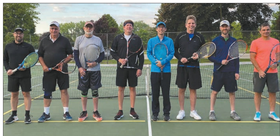
THE DAWN TENNIS LEAGUE, which celebrated its 50th season this summer, features singles (left) and doubles (right) players.