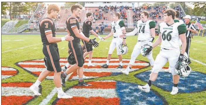
PLAYERS SHAKE HANDS at midfield, where the Panthers' logo was specially painted for 9-11.