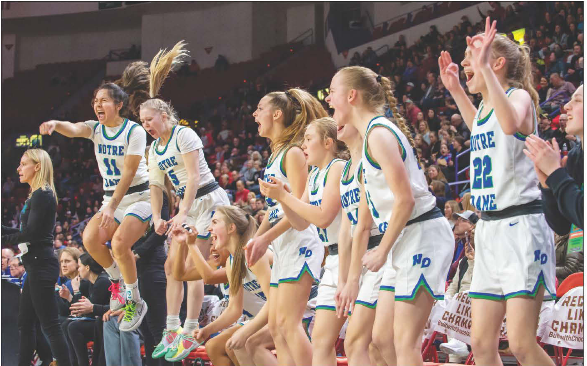
The Notre Dame Academy girls' basketball team celebrates its second consecutive WIAA Division 2 state title March 12. The Tritons beat Pewaukee in the championship game, 68-54.