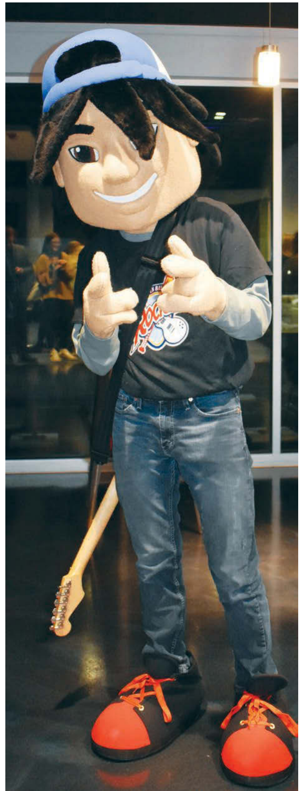
The new Rockers mascot, Rhodie.

The Rockers season is scheduled to begin May 30 against Wisconsin Rapids.