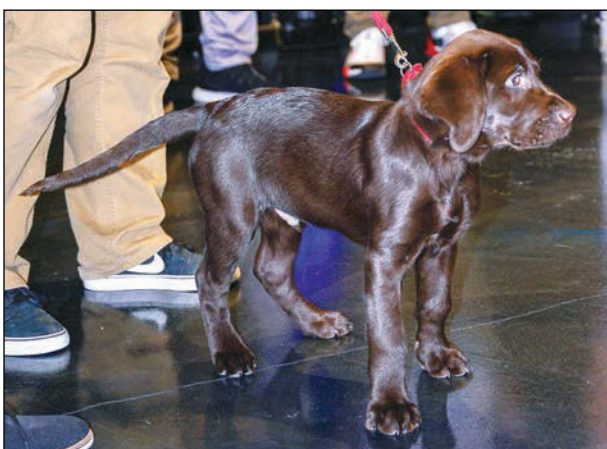
The new bat dog, Luke.