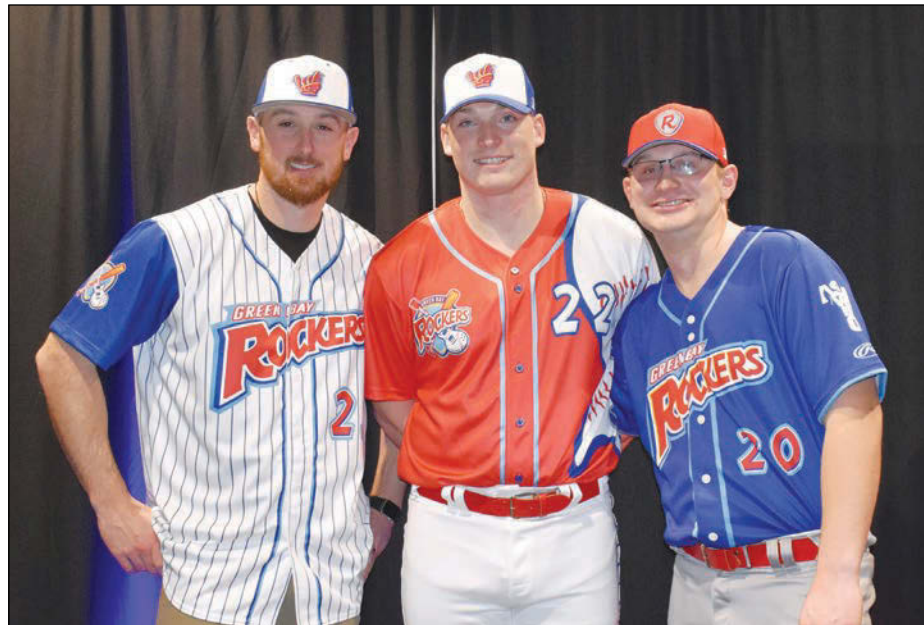
The Green Bay Rockers Baseball Club unveiled its new uniforms for the upcoming season.

The hype leading up to the mascot unveiling featured a video highlighting the feet of the team's new mascot traipsing all around the City of Green Bay, with stops at Lambeau Field, the Resch Center and finally,