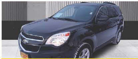
'15 Chevy Equinox LT AWD 133K Miles, Auto, Full Power Options, Power Seat, Bluetooth, Backup Camera, Keyless, AC, Cruise, Alloys, Stk# V821012 $14,990