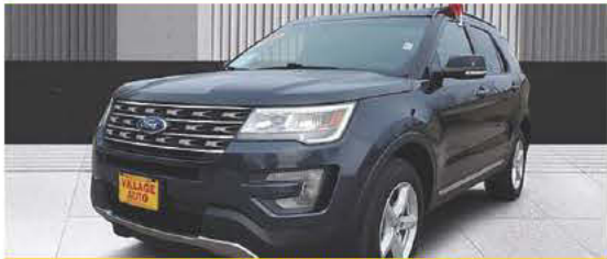
'17 Ford Explorer XLT 4x4 1 Owner, 141K Miles, Auto, Full Power Opts, Power Seats, Bluetooth, Backup Camera, Remote Start, 3rd Seat, DVD, Cruise, Keyless, Alloys, Tow Pkg, Stk# V1021074 $20,990