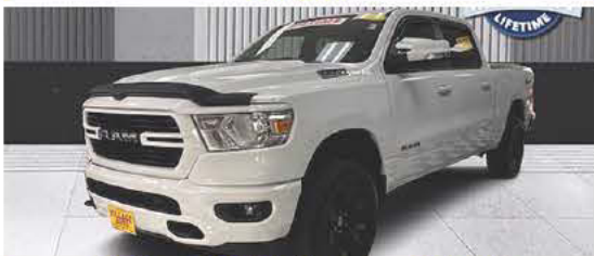
'19 Ram 1500 Big Horn Crew Cab 4x4 1 Owner, 72K Miles, Auto, Full Power Options, Power Seat, Bluetooth, Backup Camera, Remote Start, AC, Cruise, Bedliner, Alloys, Tow Pkg, Stk# H521041 $36,990