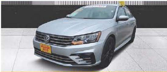
'18 VW Passat R-Line 43K Miles, Auto, Heated Leather, Full Power Options, Bluetooth, Backup Camera, CD, Keyless, AC, Cruise, Alloys, Stk# V1021024 $21,990