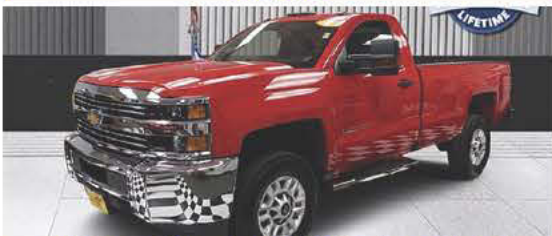
'18 Chevy Silverado 2500HD W/T Reg Cab 4x4 18K Miles, Auto, Power Windows, Locks & Mirrors, Backup Camera, Bluetooth, Bedliner, Alloys, Tow Pkg, Stk# H122001 $36,990