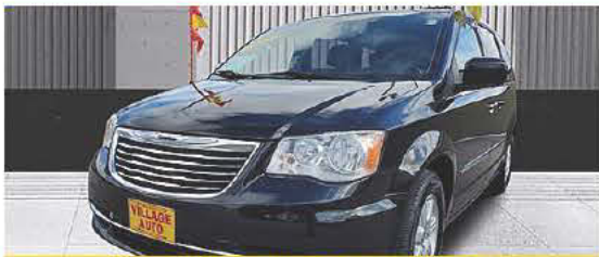
'12 Chrysler Town & Country Touring 157K Miles, Leather, Auto, Full Power Options, Power Seat, Remote Start, Backup Camera, Bluetooth, 3rd Seat, DVD, Rear Air, New Tires, Stk# V122035 $9,990