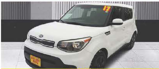
'17 Kia Soul 96K Miles, Auto, Power Windows, Locks & Mirrors, Bluetooth, Keyless, AC, Cruise, Alloys, Stk# V1121037 $13,550