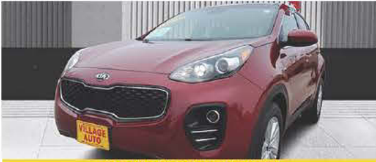
'17 Kia Sportage LX AWD 112K Miles, Auto, Power Windows, Locks & Mirrors, Backup Camera, Bluetooth, CD, AC, Cruise, Keyless, Alloys, Stk# V1221027 $16,990