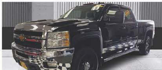
'13 Chevy Silverado 2500HD LTZ Crew Cab 4x4 Diesel, 105K Miles, Auto, Heated Leather, Full Power Options, Remote Start, Backup Camera, Bluetooth, Bedliner, Alloys, Tow Pkg, Stk# H621010 $40,990