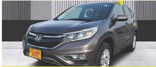
'16 Honda CR-V EX AWD 106K Miles, Auto, Heated Seats, Full Power Options, Moonroof, Bluetooth, Backup Camera, CD, AC, Cruise, New Tires, Alloys, Stk# V1121069 $20,990