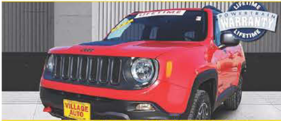
'16 Jeep Renegade Trailhawk 4x4 78K Miles, Auto, Power Windows, Locks & Mirrors, Backup Camera, Bluetooth, Remote Start, AC, Cruise, Alloys, Stk# V222017 $20,990