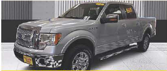
'11 Ford F-150 Lariat Super Crew 4x4 123K Miles, Auto, Heated/ Cooled Leather, Full Power Opts, Backup Camera, Bluetooth, Remote Start, CD, AC, Cruise, Bedliner, Alloys, Stk# V122006 $19,990