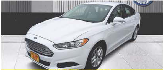
'15 Ford Fusion SE 84K Miles, Auto, Power Windows, Locks & Mirrors, Bluetooth, Backup Camera, CD, AC, Cruise, Keyless, Alloys, Stk# V1121067 $14,550