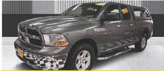
'12 Ram 1500 SLT Quad Cab 4x4 1 Owner, 123K Miles, Auto, Power Windows, Locks & Mirrors, CD, AC, Cruise, Keyless, Bedliner, Alloys, Tow Pkg, Stk# H122063 $17,990