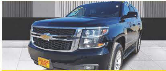
'15 Chevy Tahoe LT 4x4 119K Miles, Auto, Heated Leather, Full Power Opts, Backup Camera, Bluetooth, 3rd Seat, Adj Pedals, Remote Start, Rear Air, Alloys, Stk# V1221052 $31,995