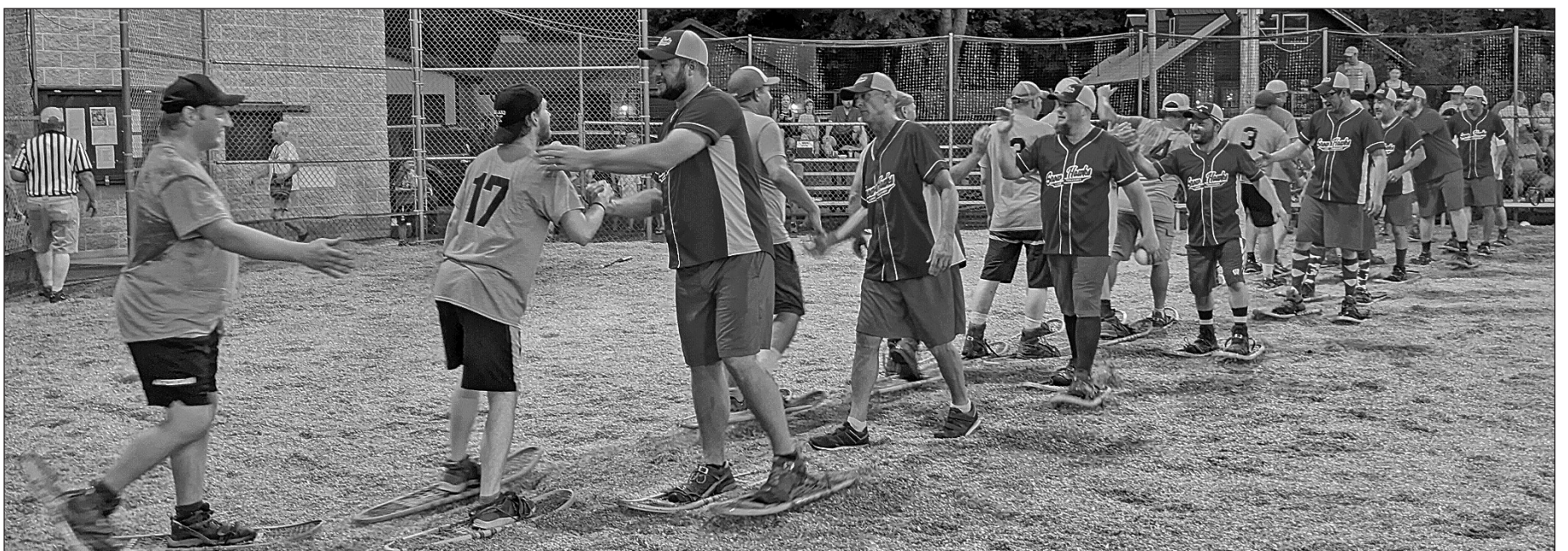
The Lakeland Times and Snowhawks shake hands at the end of the game.