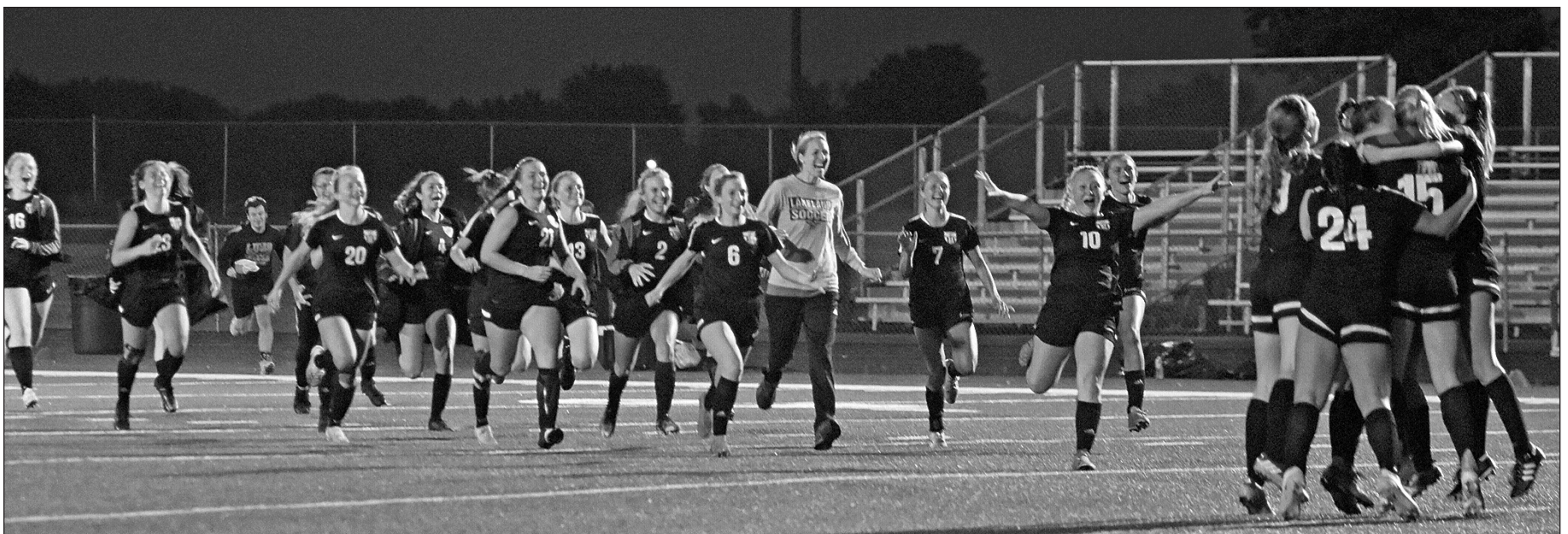
The Thunderbirds storm the field after defeating Rice Lake to advance to state.