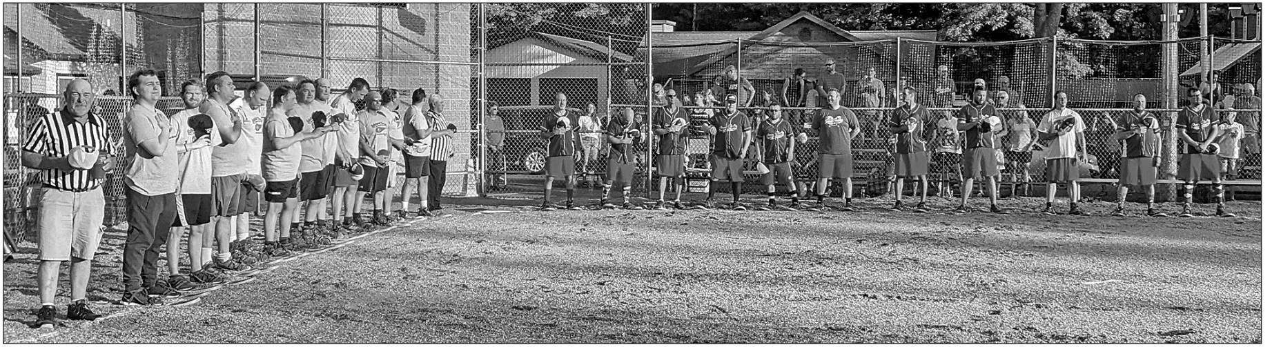
The Lakeland Times and the Snowhawks line up for the national anthem.