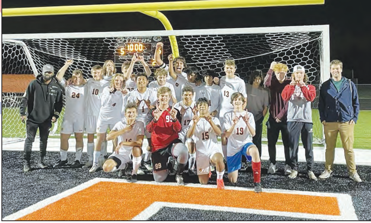
The Sparta boys soccer team pulled off the unlikely upset Tuesday night in the first round of the WIAA regional tournament as the eighth-seeded Spartans bested the top-seeded New Richmond Tigers in a shootout. Sparta won the game on penalty kicks after outscoring the Tigers 5-4 in the final tiebreaker scenario.

to shoot and his shot was saved to keep the score 1-0. New Richmond would go on to score tying it all up at one apiece.