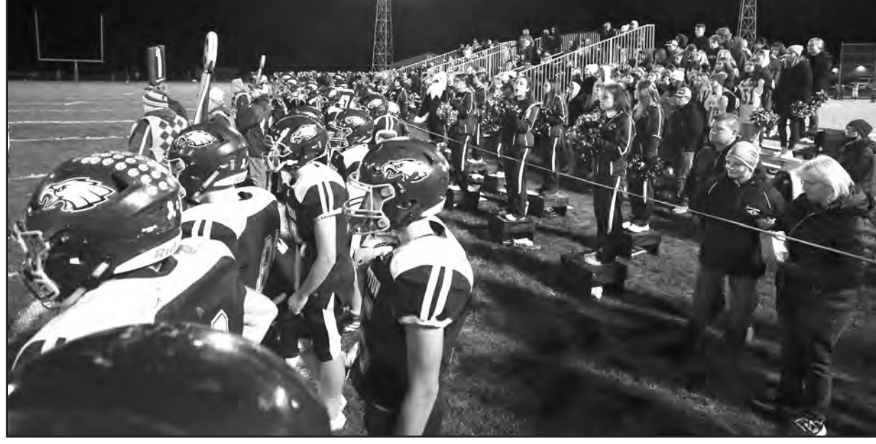
The Cashton sideline was full of life during Friday's game with Bangor. Fans lined up along the entire 100-yard stretch of field to watch their hometown team take on their rivals with a chance at sealing up an outright conference title.

Ultimately, both Bangor and Cashton got to play football last spring during the alternate season, and there were gratifying moments that came along with that. Both those teams performed well and met in a