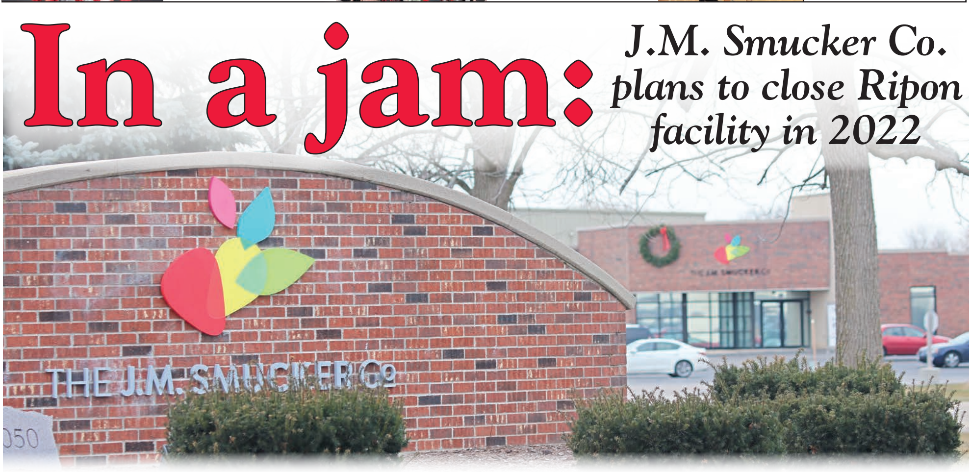
THE J.M. SMUCKER Co. announced last week that it plans to close its Ripon facility at 1050 Stanton St. in 2022. The plant employs 92 people.

RC men rise to the challenge, defeats Bethany, p. 16