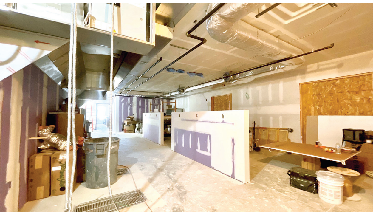
It may not look like much now, but this will be the main kitchen that will be supplying food to the in-house residents as well as the senior meal sites throughout the county.