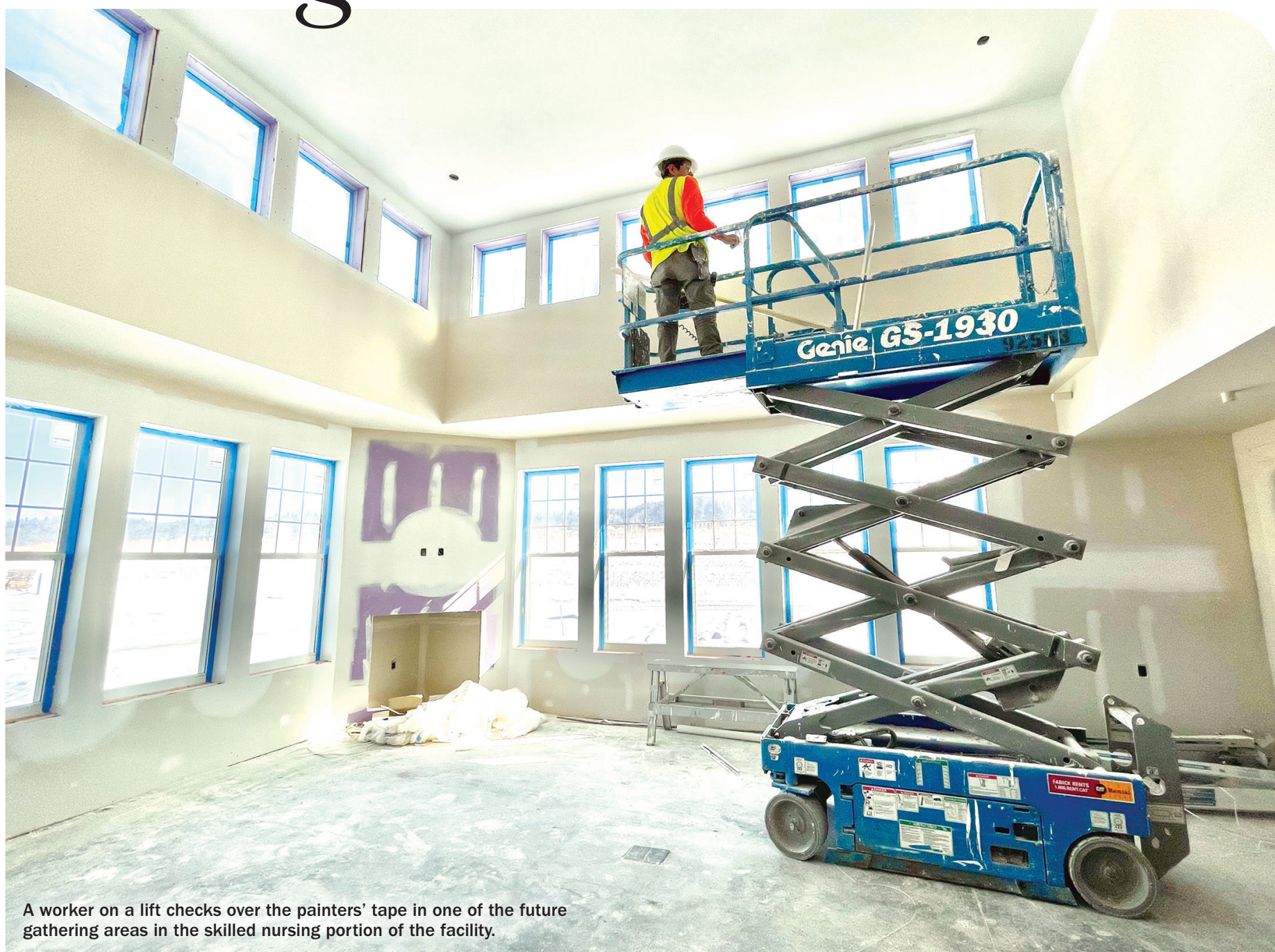
A worker on a lift checks over the painters' tape in one of the future gathering areas in the skilled nursing portion of the facility.