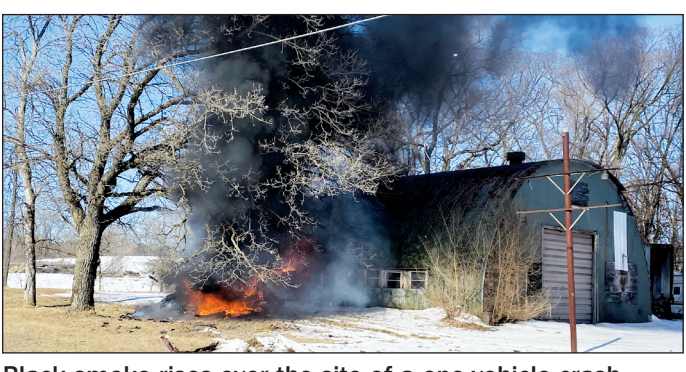
Black smoke rises over the site of a one-vehicle crash. One person was killed in the accident.