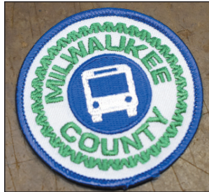
A Milwaukee County Transit patch.