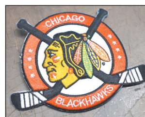
Chicago Blackhawks patch.