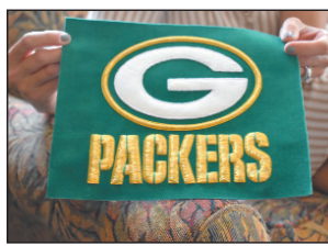
Green Bay Packers patch.