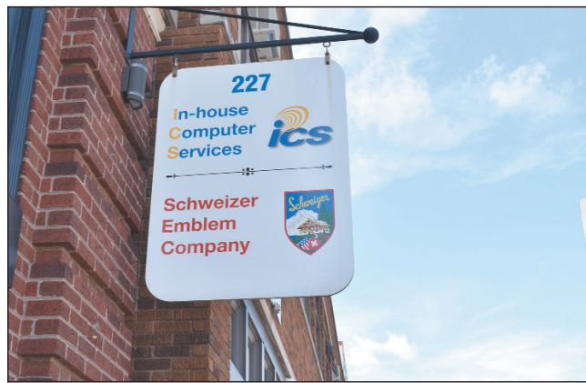
Schweizer Emblem Company moved to Waukesha in 2015.