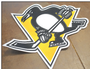
Pittsburgh Penguins patch.