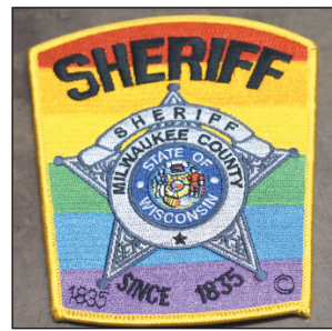
A Milwaukee County Sheriff's Department pride patch.