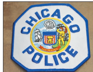
Chicago Police Department patch.