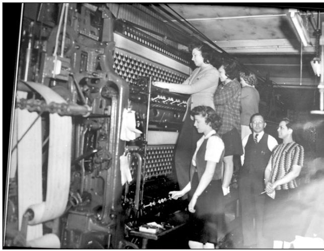
An undated photo shows workers using an embroidery machine when the Schweizer Emblem Company was located in Chicago. Production has since been outsourced in the U.S. and overseas.