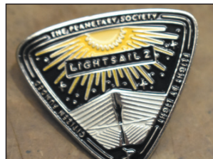
The Planetary Society pin.