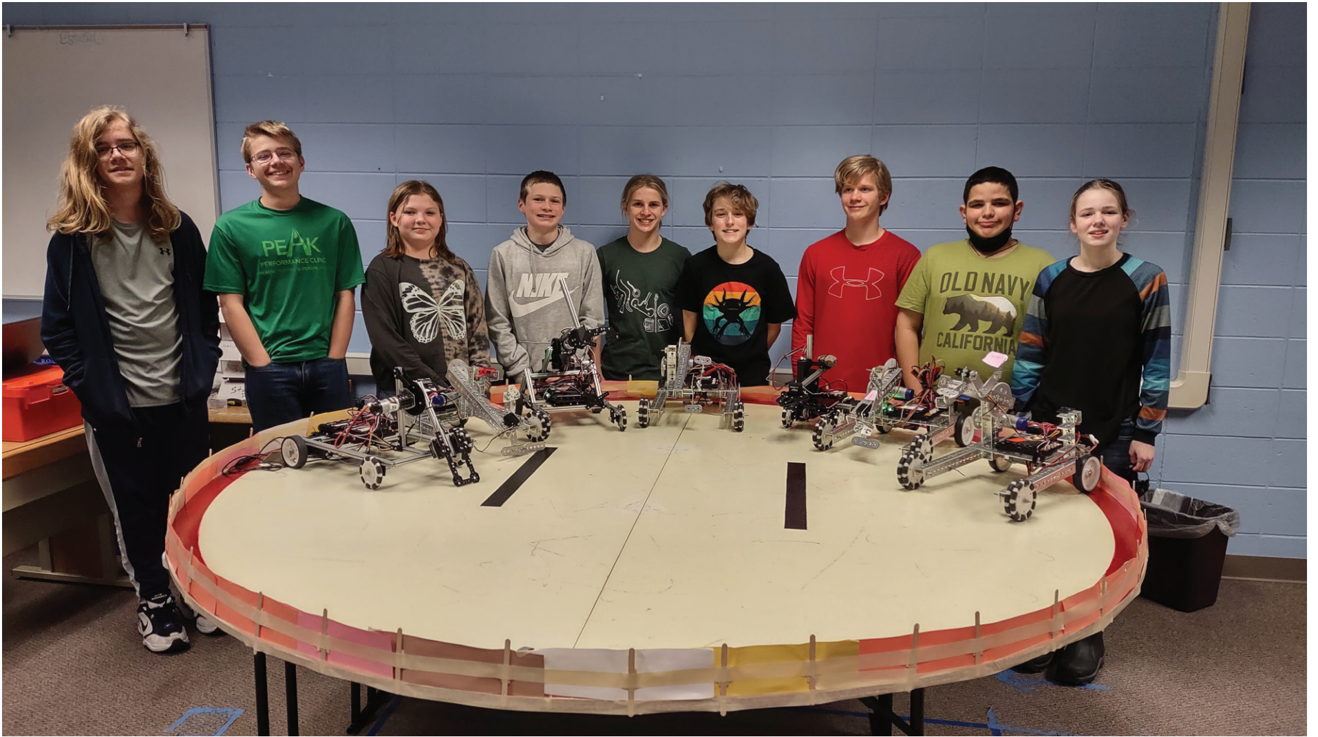
Robot Club members pose with their robots.