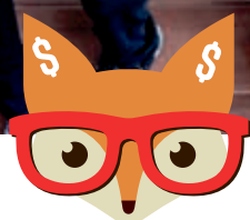
Federally insured by NCUA