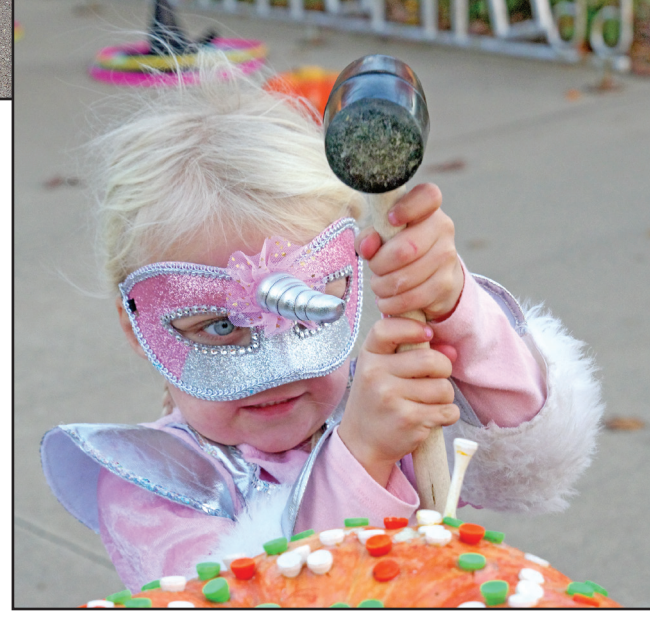
A lot of candy passed into the hands of youth this past Sunday. Meanwhile, some outdoor fun could be found at Schreiner Memorial Library.