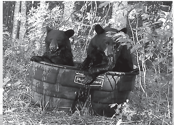
TRAIL CAMERA OF: ELDON CARLSON, CHIPPEWA COUNTY

Starting September 1, 2021, enter weekly for your chance to win one of the grand prizes! Winners chosen weekly to enter into the grand prize contest. Contest runs September 1 through November 30, 2021. Photos must be e-mailed to tyler@thechetekalert.com each week by noon on Friday.